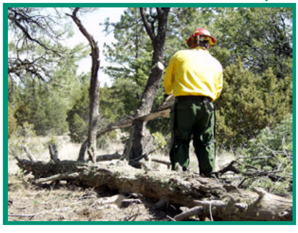
A member of the field office fire crew uses a chainsaw to thin fuels.

2002, it became apparent there was an opportunity to provide the residents more information about managing the fuels around their homes and creating defensible space.