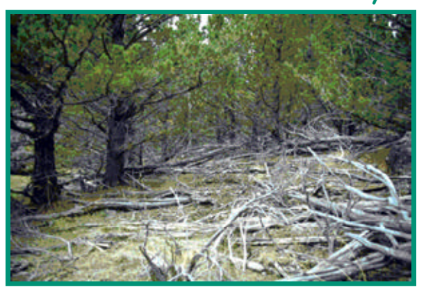
Western juniper established in quaking aspen plant community. Notice the dead aspen trunks on the woodland floor.

A prescribed fire was applied in the fall of 2001. Three thousand acres were treated. Approximately 50 percent of the project area was burned, producing a mosaic of burned and unburned areas. Initial results from the fire indicate that there was a 50 percent reduction in the western juniper cover and a two to four times increase in under story vegetation cover. The East Ridge project will continue in 2003 with the burning of 1,500 acres of public and private land on the west side of Kiger Creek.