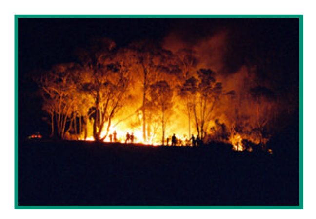
The U.S. handcrew burns out the eucalyptus forest around a farmer's fenceline near Tubbut, East Gippsland.