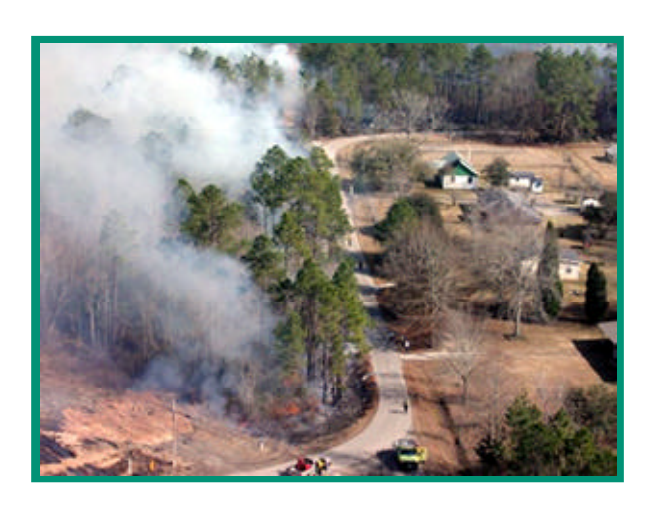
Prescribed burn on Sandhill Crane National Wildlife Refuge in southern Mississippi. The burn was closely monitored due to the close proximity of homes.

Overall, the Hotshots provided ignition and holding support for approximately 25,000 acres.