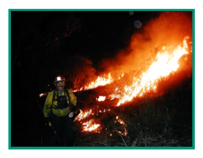
Flagstaff Hotshot Superintendent Paul Musser backburns eucalyptus underbrush near the town of Tubbut, Victoria.