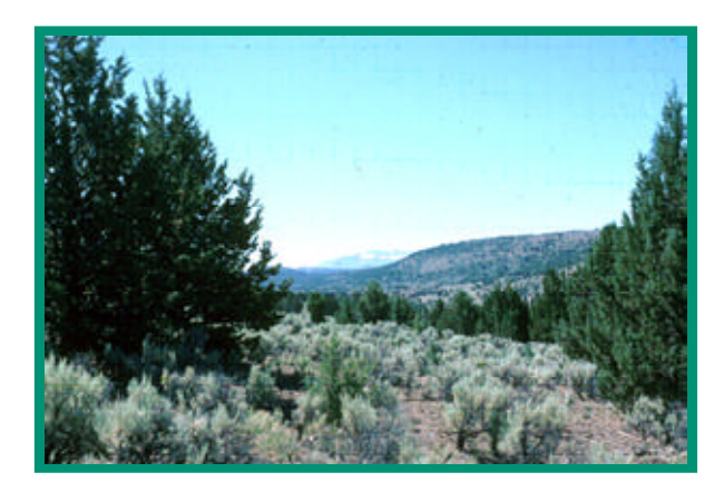
Western juniper woodlands in mountain big sagebrush plant community on Steens Mountain.

Responding to the situation, BLM initiated the East Ridge Ecosystem Restoration Project in 2000. The overall objective is to reduce the influence of western juniper on mountain big sagebrush, quaking aspen and riparian plant communities. The BLM Burns District has been using a combination of mechanical treatments and prescribed fire to reduce the influence of western juniper and restore pre-encroachment plant communities across the project area. Treatment of the plant community will also help to reduce the chance of high intensity, stand replacing fires in the juniper woodlands.