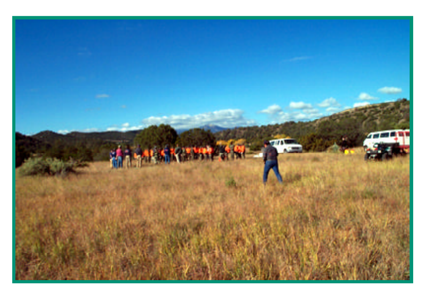
Squad members listen during an orientation session.

After a short project orientation and safety presentation by ten firefighters, the cadets broke down into squads with a BLM firefighter as squad leader. For the first hour the cadets energetically moved and piled slash. At the end of the day, all 35 acres were piled and made ready to burn. Based on the success of the volunteer work, future projects are being planned for the cadets in the wildland urban interface.