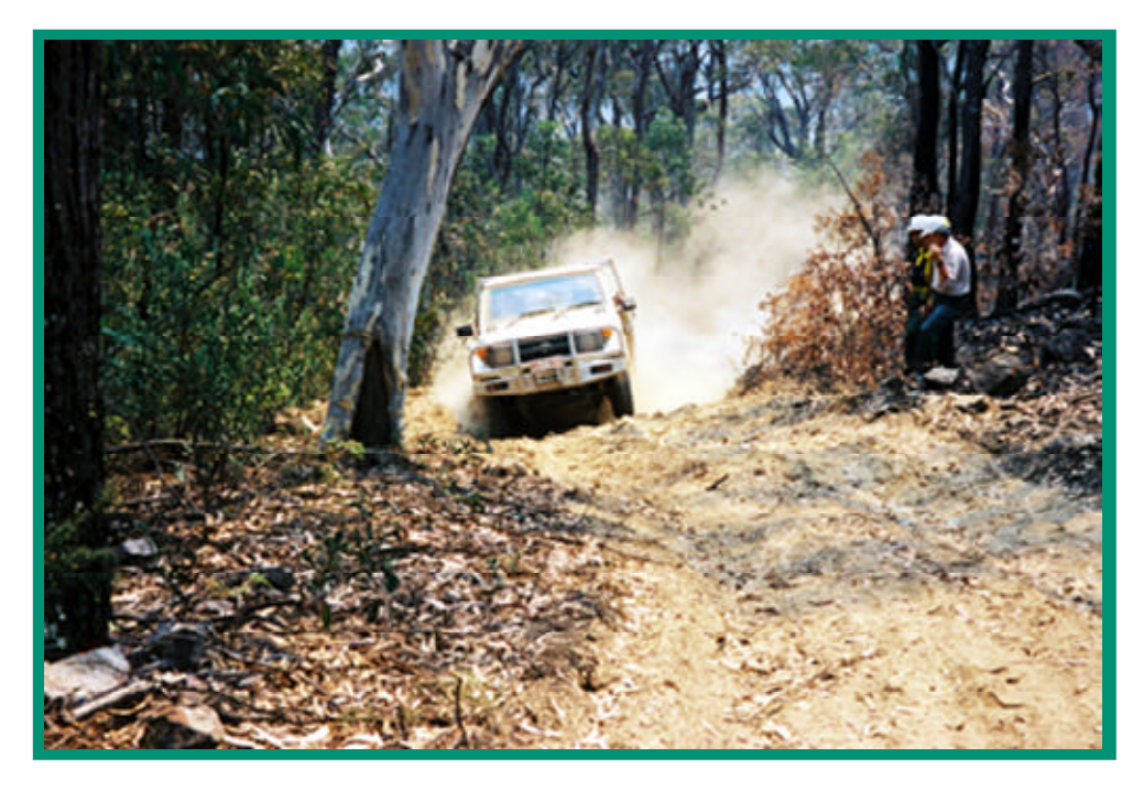
A pair of American firefighters negotiate an Australian bush track on the way to the fireline. The vehicle is a "pig," an Australian 100-gallon engine.