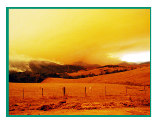
An eerie light is cast over East Gippsland by the East Victoria fire that covered more than two million acres.

Photos for this story were taken by team members assigned to Australian fires between January and March this year.