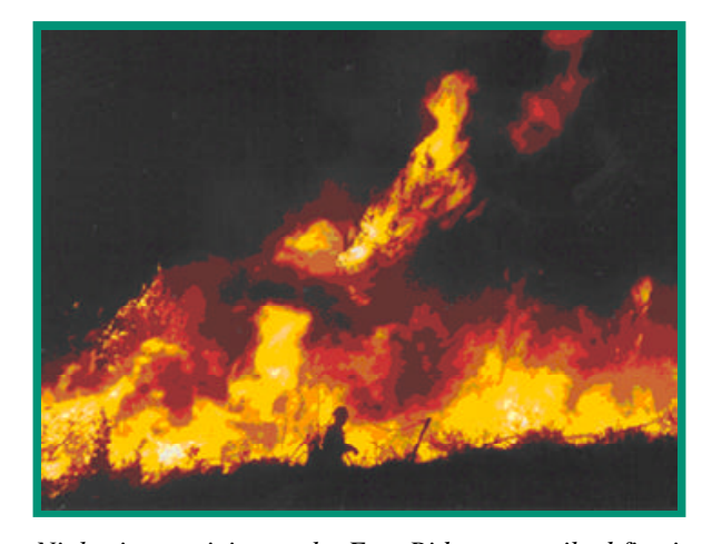
Night time activity on the East Ridge prescribed fire in September 2002.