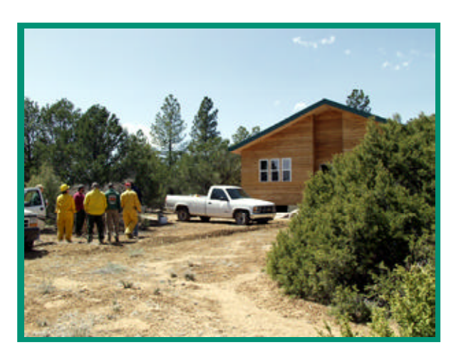
Residents of the subdivision arrive on site with members of the fire crew.

Coordinating with the fire chief of the subdivision, it was decided to have the project work coincide with community monthly meetings. This opportunity gave Bureau personnel and the local fire chief to show local residents the process of creating defensible space as well as encouraging community involvement with the actual thinning work. It achieved the main objective of educating the landowners within the subdivision on how to create a defensible space around a residence in a fire adapted ecosystem.