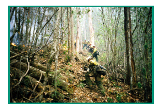
U.S. firefighters cut handline around a 10-acre spotfire in heavy mountain ash/stringy bark forest a few miles east of the Snowy River.