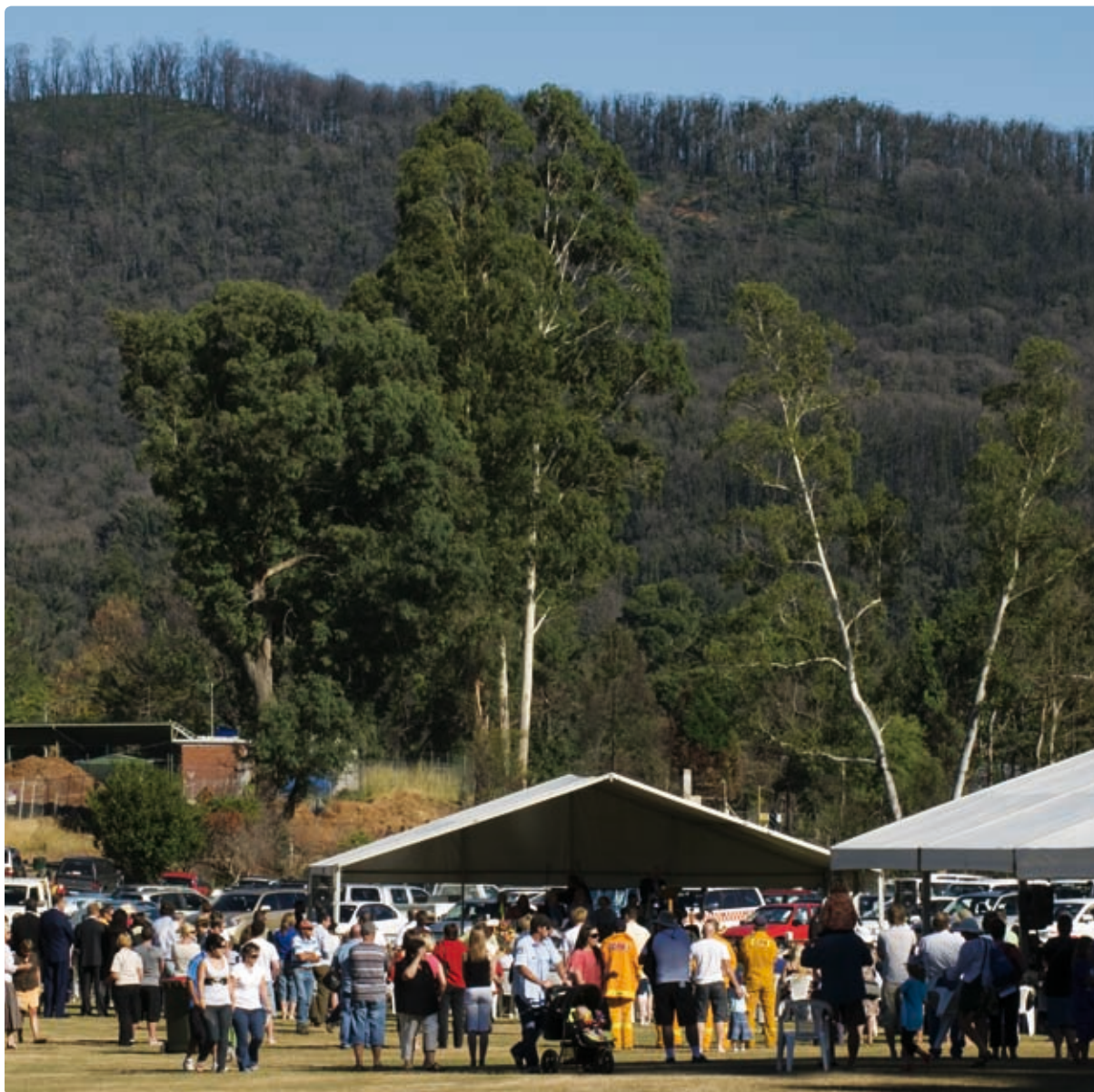
Image 5 Marysville gathers to remember Black Saturday