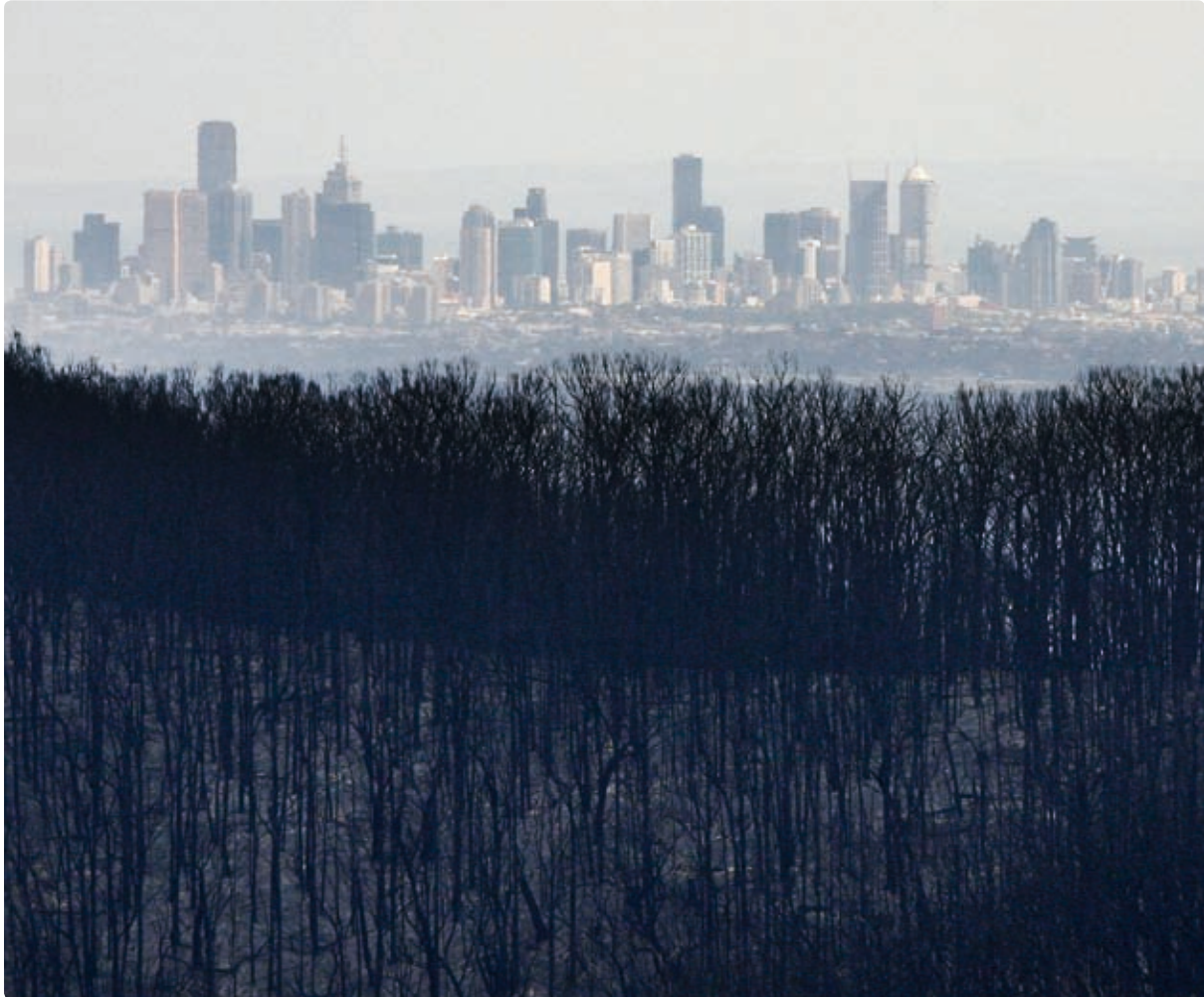
Image 4 Looking to Melbourne from the Kinglake Ranges