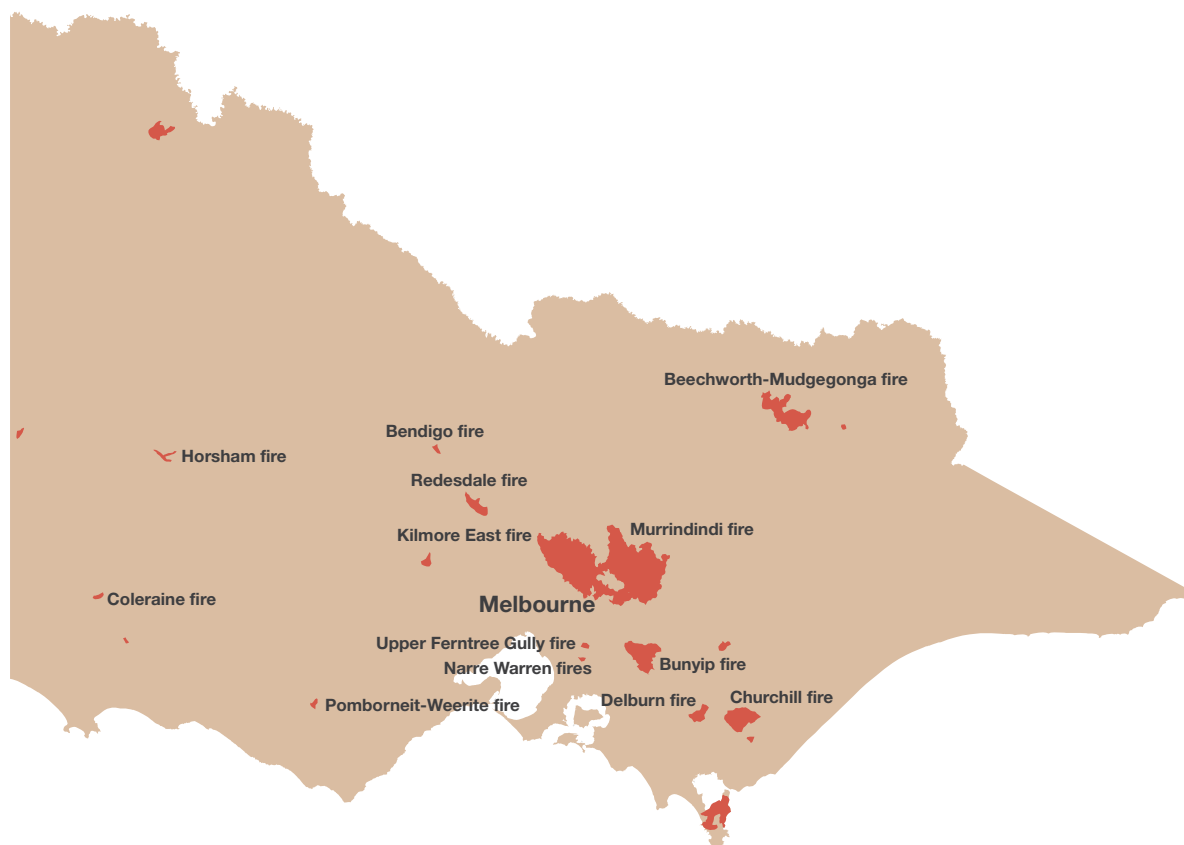
Figure 1 The January–February 2009 bushfires

Victoria has a long, sometimes devastating, history of fire. The conditions on 7 February gave rise to particularly destructive bushfires. These very intense fires share some features that set them apart from less intense fires. Very dry fuels and strong surface winds resulted in erratic fire behaviour and the development of strong convective activity capable of lifting firebrands such as burning bark high in the convection column. Strong upper air winds transported burning bark downwind for many kilometres, resulting in long-distance fire spotting.