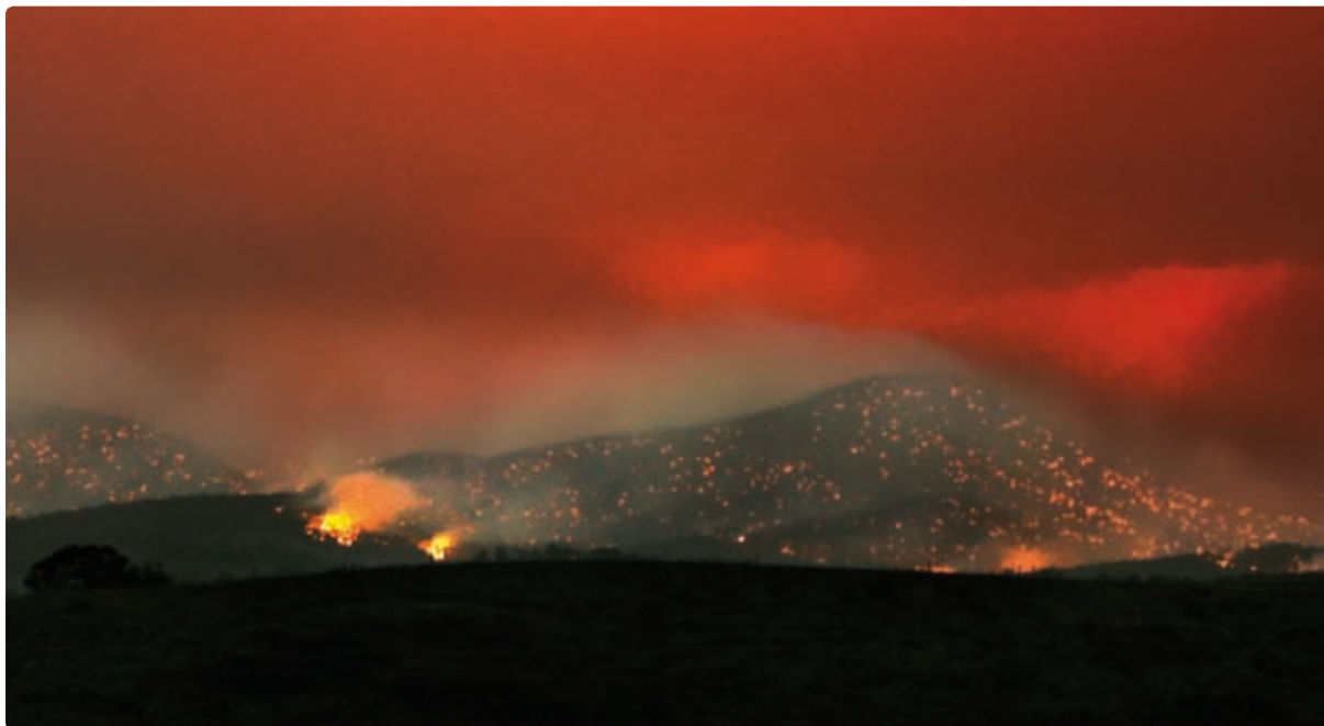
Image 3 Fires near Kinglake