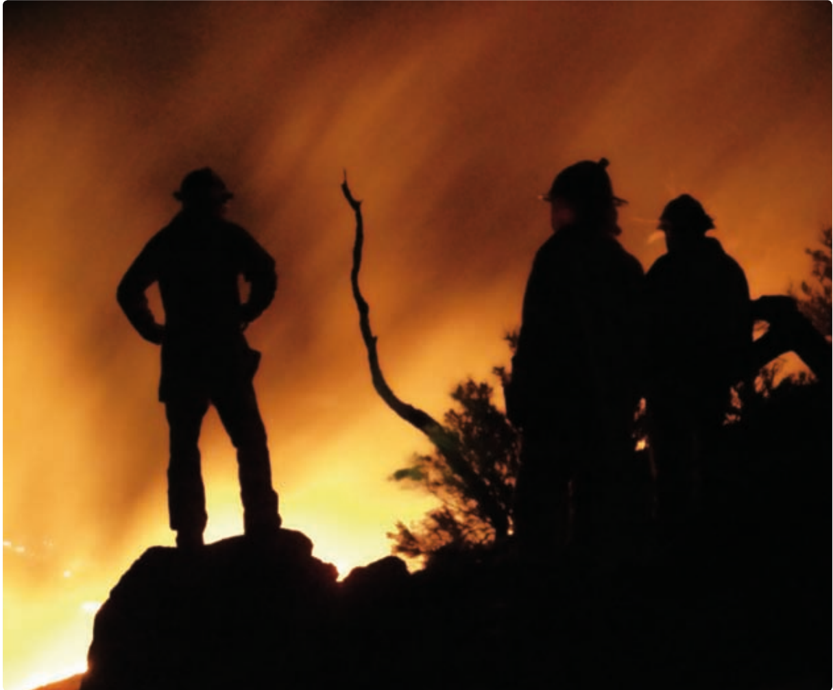
Image 1 The Redesdale fire