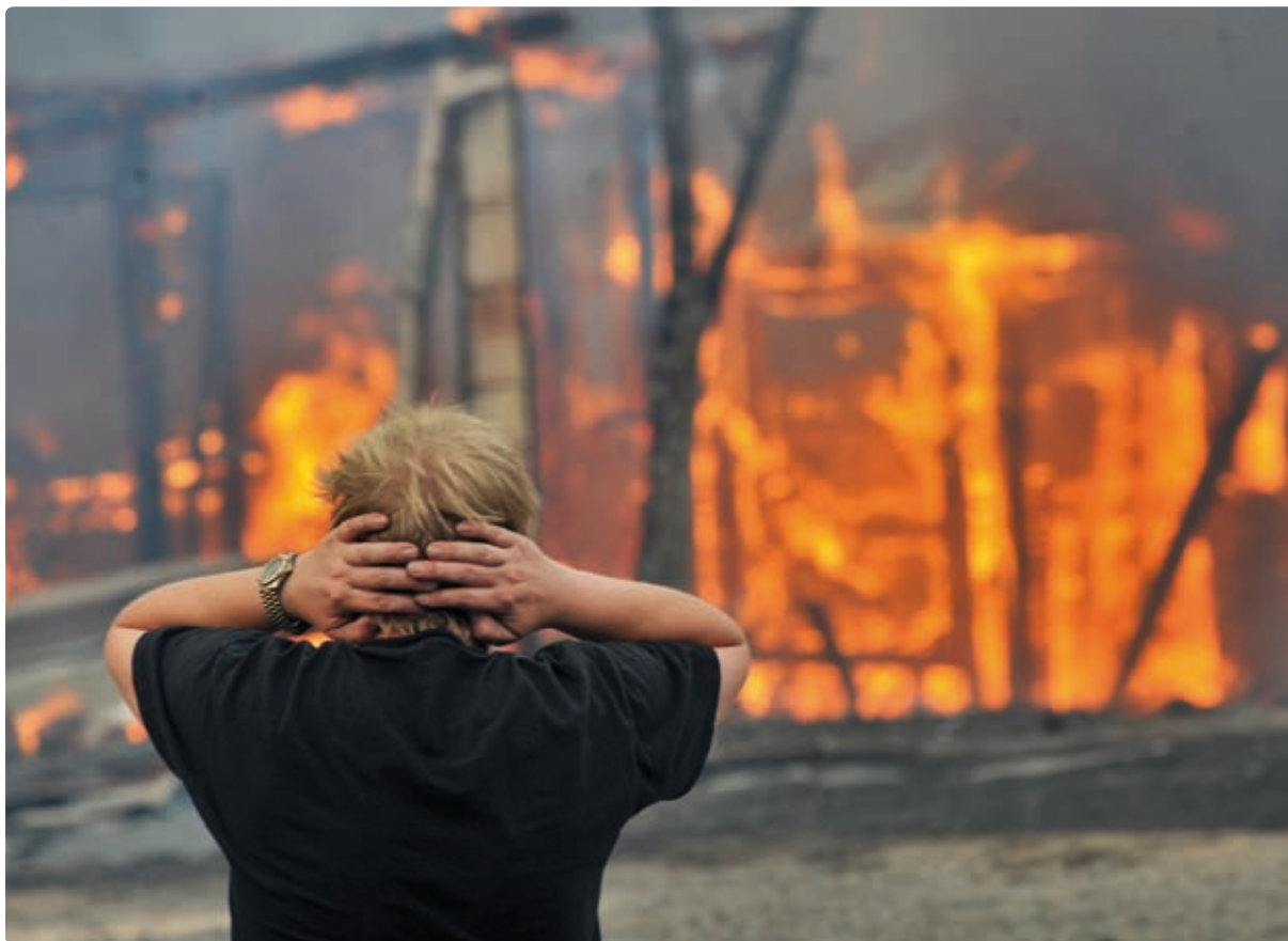
Image 2 The Bendigo fire