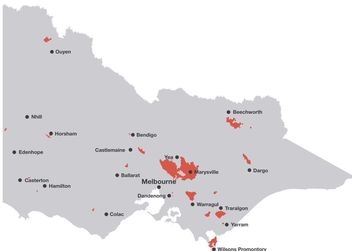
Figure 1 The January–February 2009 bushfires