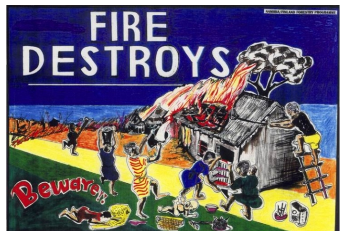
Both public awareness-raising posters from Africa were developed by local artists in Namibia, in the frame of the Namibia-Finland Forestry Programme.

For more information on early warning systems for wildland fire see GFMC at: http://www.fire.uni-freiburg.de/fwf/fwf.htm