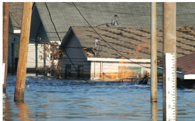
A gas fire burns next to this New Orleans home from underneath the flood water.

several days traveling or who feared for their pets. The handicapped, the elderly and children are especially vulnerable. Another factor is that poorer housing is more fragile and easily destroyed when exposed to strong winds and is more vulnerable in lowlying locations. This is partly due to exploited land use and laissez-faire location decisions in the past. Specialists have warned for long time that New Orleans, which is a city built partially below sea level, was heading for a catastrophic disaster.