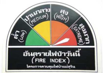
Fire Index sign used in Thailand to inform local populations on the daily fire danger.