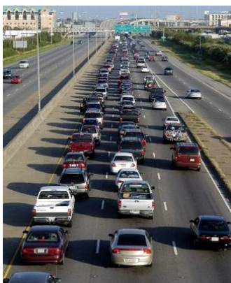
People preparing their homes for the forecasted hurricane Katrina. Most of the people who were able to leave the city followed the advice to evacuate to low-risk regions.