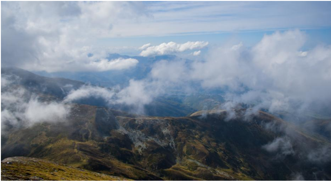
Shar/Sara Mountains, North Macedonia