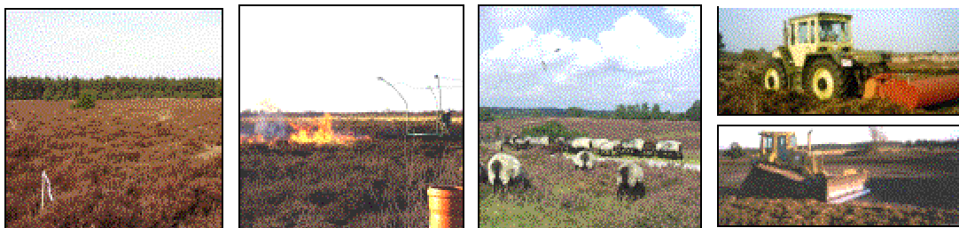
Fig. 2: Different management measures in Lüneburger Heide nature reserve and Neustädter Moor nature reserve (from left to right: [1] typical Calluna -dominated heathland in Lüneburger Heide nature reserve, [2] Prescribed burning in Neustädter Moor nature reserve, [3] Grazing by Gray Horned Heath Sheep (Graue Gehörnte Heidschnucke), [4 top] Mowing, [4 bottom] "Plaggen")