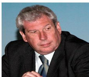
Elliot Morley , Minister for Environment, UK facilitated a discussion on "Maintaining International Commitment to Sustainable Forest Management" in morning and afternoon sessions of the Ministerial Meeting on Forests