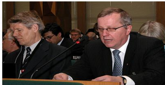
Finland highlighted the usefulness of FAO Forestry Outlook Studies and the Forest Resource Assessment in developing national forest programmes