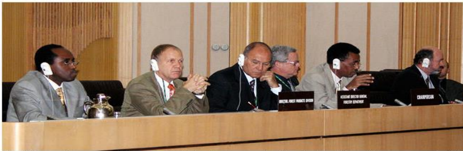
Panelists consider comments from country delegations concerning the shaping of the action programme for FAO in forestry