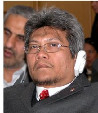
Indonesia tells of Fire Brigades being set up in fire prone areas