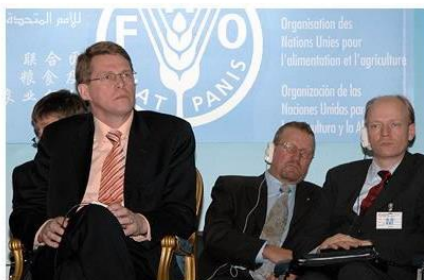
His Excellency Matti Vanhanen , Prime Minister of Finland, said that forests are essential to ensuring environmental sustainability and are a source of basic survival needs