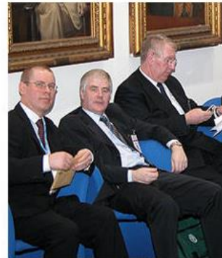
Participants take a break before heading off to the reception