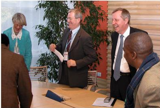
Finnish and South African delegates share a laugh during a break in the Ministerial discussions