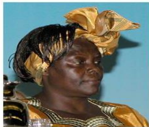
Wangari Maathai, Kenya