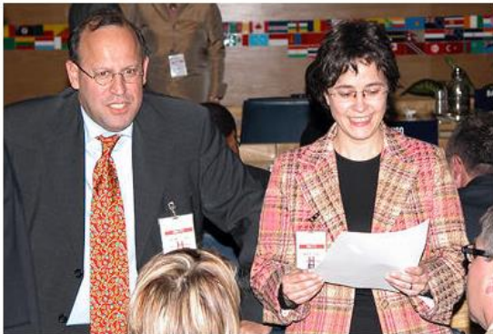
Delegates reading the final Ministerial Statement