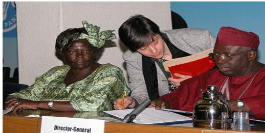
Wangari Maathai , winner of the 2004 Nobel Peace Prize (left) with Jacques Diouf , Director-General, FAO