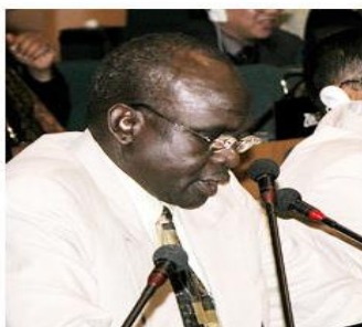
Sudan explained its new forest initiatives, including the recent adoption of a national forest programme and the implementation of a project in support of the IFF/IPF proposals for action