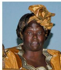
Nobel Laureate Wangari Maathai , Kenya, emphasized that investing in forests would help prevent future violent conflicts