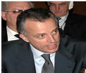
Paolo Scarpa Bonazza Buora, Minister of Agriculture and Forest Policies for Italy, identified several social issues that contribute to the degradation of forests, such as urbanization, illegal logging and fire, and argued that mitigating the effects of these requires a multilateral approach