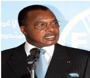
President Denis Sassou-Nguesso , Republic of Congo, highlighted FAO's major role in coordinating knowledge on forest resources and in providing technical and financial support to member countries

The Ministerial Meeting on Forests was Co-Chaired by Elliot Moorely, Minister of Environment (UK) and Carlos Manuel Rodriguez Echandi, Minister of Environment and Energy (Costa Rica).