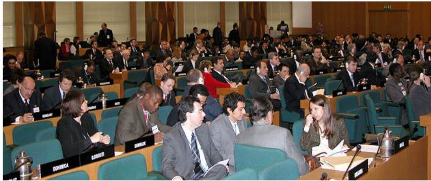
Participants in the Green room "Maintaining International Commitment to Sustainable Forest Management"