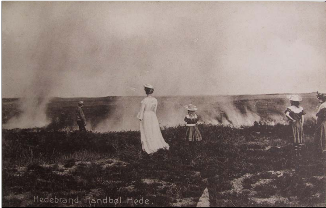
Danish postcard showing a fire set in Randbøl Hede – today Randbøl Hede Nature Reserve – in the early 20 th Century.