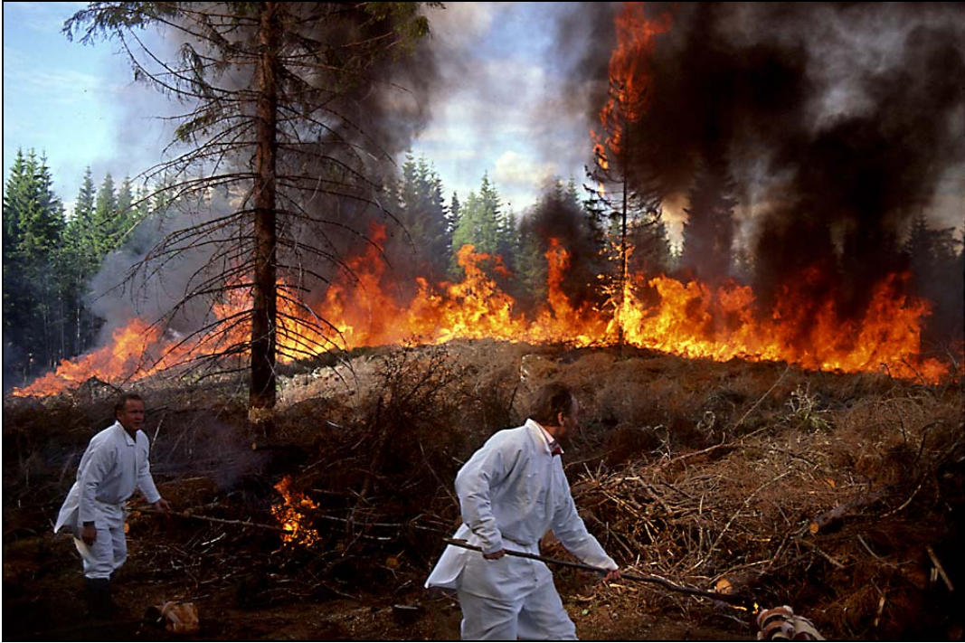
Demonstration traditional slash-and-burn practice in Koli National Park, Finland.