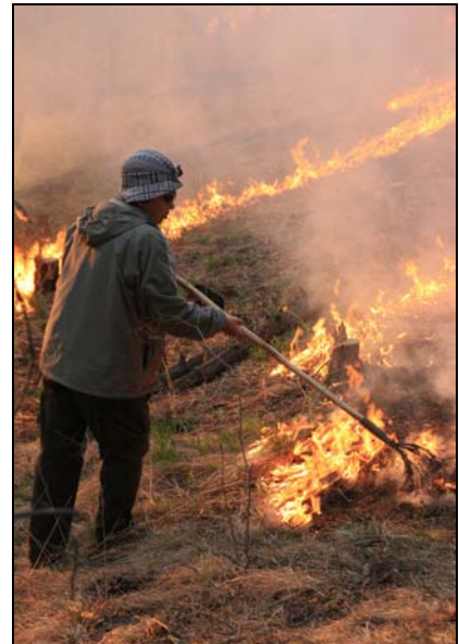
Joint training of professionals and local villagers in the use of prescribed fire for wildfire hazard reduction in native mountain pine forests ( Pinus sylvestris ) in northern Mongolia. The hand-over of prescribed fire by scientists to the practitioners is a high priority issue aimed at reducing destructive wildfires.