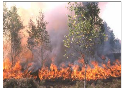
Control of birch and pine succession (left) in Zschornoer Heide Nature Reserve (Brandenburg State, Germany) is controlled by prescribed fire (middle and right: prescribed burning in 2002).