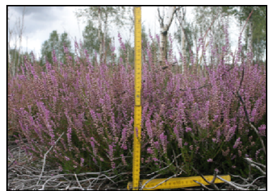
Post-fire views of prescribed burns in Zschornoer Heide Nature Reserve immediately after the burn (left) and two years after the fire.