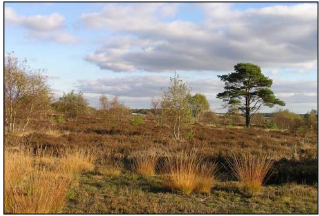
Structurally rich heath-juniper ecosystems with individual pine and birch trees in Lunenburg Heath Nature Park shaped by fire, grazing and mechanical treatment. Photos: R. Köpsell and J. Prüter).