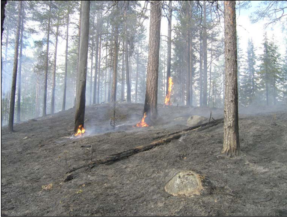
The main objective of prescribed fire application in the Stormyran-Lommyran nature reserve (Sweden) is to restore open stand structures and provide habitats for fire-dependent and fire-adapted species, e.g. the insect species Stephanopachys linearis and S. substriatus , Aradus spp..