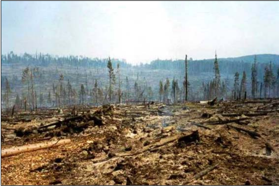
Use of prescribed broadcast burning in a coniferous forest clearcut in Siberia (“dark taiga” – with main species Abies sibirica , Picea sibirica , Pinus sibirica , Betula pendula , Populus tremula ) east of Yenisey river (Yenisey Ridge), Bolshaya Murta leskhoz, in June 1997, for slash removal and stimulation of forest regeneration.