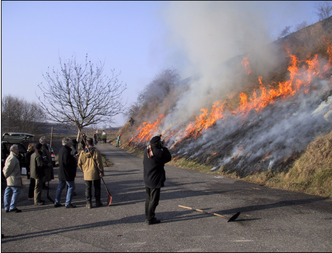
Prescribed fire is used to maintain openness of fallow slopes in the Kaiserstuhl viticulture region. Fire is now replacing traditional mowing (Southwest Germany).

The targeted application of small-sized fires for creating mosaic- or edge-rich habitat structures is common in the management endangered bird species, e.g. Black Grouse ( Tetrao tetrix ) (cf. 2.2.3), capercaillie ( Tetrao urogallus ) and Hazel Grouse ( Tetrastes bonasia ). While capercaillie habitat management by fire has been proven successful in Scottish pine-heath forests (Bruce and Servant, 2004), similar approaches elsewhere in Europe were less successful. For instance, capercaillie populations increased in some sites of the Black Forest (Germany) that were disturbed by hurricane “Lothar” in 1999. Wind throws and wind falls, partially salvage-logged but with snags remaining, resulted in the formation of edge-rich habitat structures preferred by capercaillie. The populations began to disappear with the onset of regeneration of spruce ( Picea abies ) and the development of succession towards dense forest. Small-scale, mosaic-rich prescribed burning application was intended to