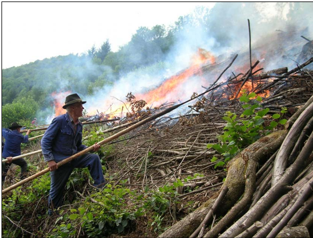
Demonstration of traditional fire cultivation practices in the Black Forest, Germany (Vorderlehengericht, June 2007).