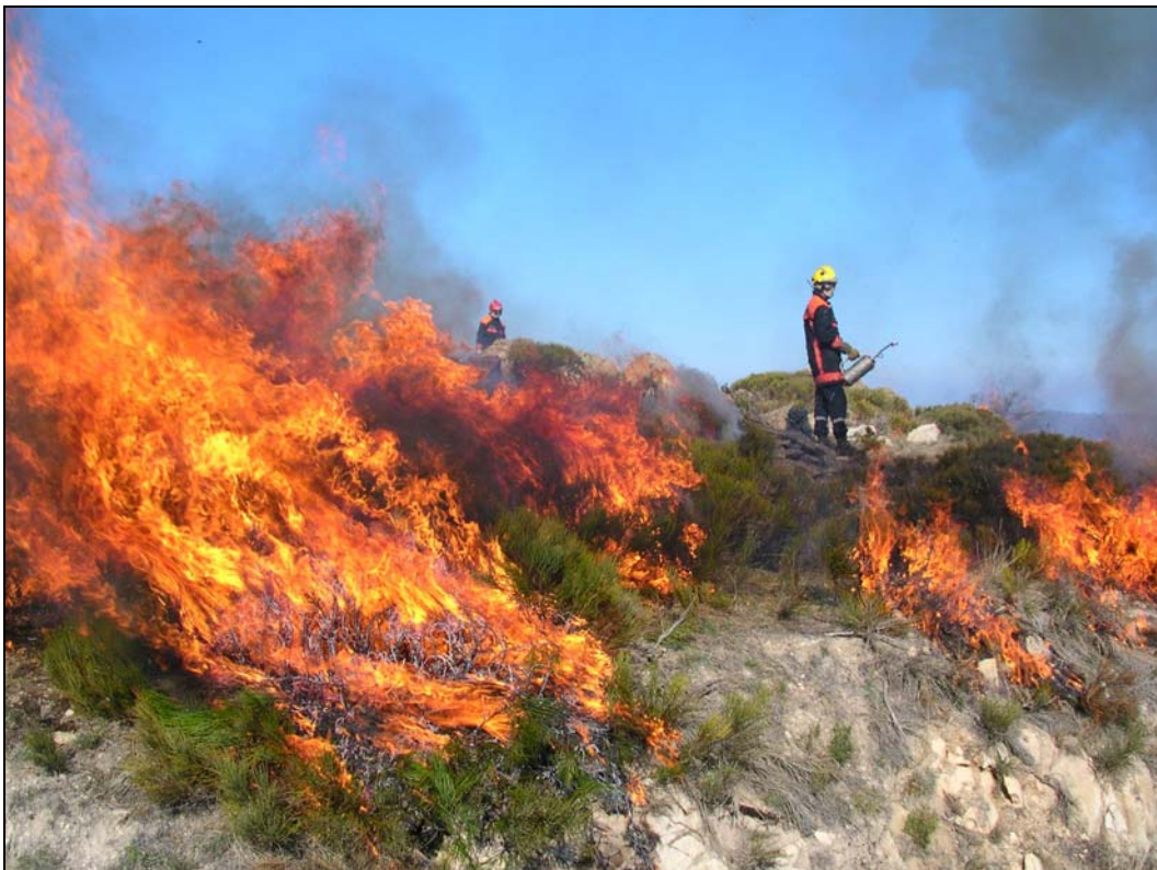
Prescribed burning of a Cystisus purgans heath in the Pyrénées-Orientales (Sournia, February 2008).

The use of fire in maintaining openness and species composition on grazing lands is the most common practice that has survived its early application throughout Eurasia. Pastures that are threatened by succession are traditionally burned in a region stretching from the Western Mediterranean via the Balkans to East Europe. Although banned by law in most countries, the burnings are still practiced in many places. Together with burning of agricultural residuals (c.f. section 2.4) pasture burnings are a major cause of wildfires that are also affecting forests and even the wildland-residential interface. The illegality of burning is often resulting in “hit-and-run” practices, i.e. pastoralists setting fires and disappear from the site in order not to be sued. This is often resulting in uncontrolled fires with a high likelihood of developing and spread of devastating wildfires to adjoining terrain. While many countries did not yet attempt to introduce a solution to this problem, Spain has made significant progress by developing a government-supported permit and support system for the use of prescribed fire for grazing improvement and fire social prevention (Velez, 2007). Similarly, prescribed burning for rangeland improvement is practiced by several French prescribed burning teams, including the Department Pyrénées-Orientales (Faerber, 2008). For a European survey on prescribed burning practices, including grazing land management, see Lázaro (2008).