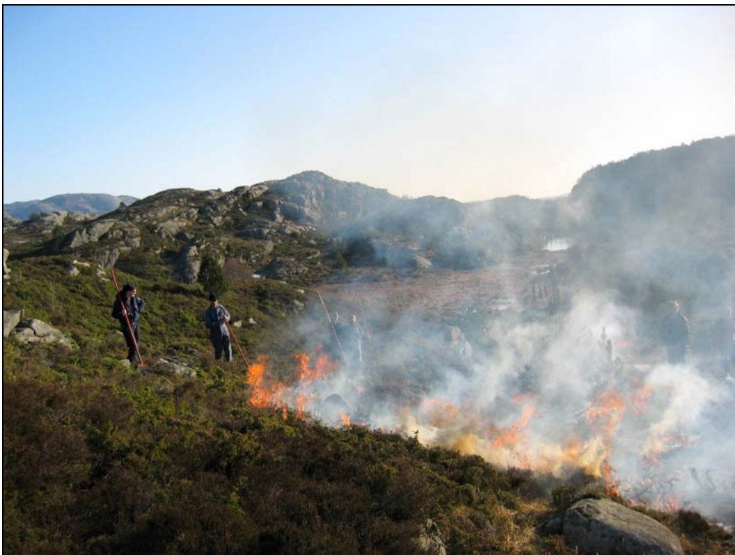
Modern farmers learning the ancient farming technique of heathland burning in Norway in 2005.