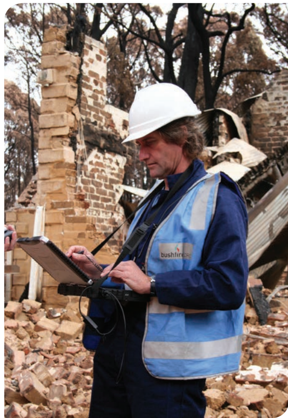
Member of the Bushfire CRC multiagency research task force analysing destroyed properties at Kinglake, Victoria, one week after the February 2009 Black Saturday fires.