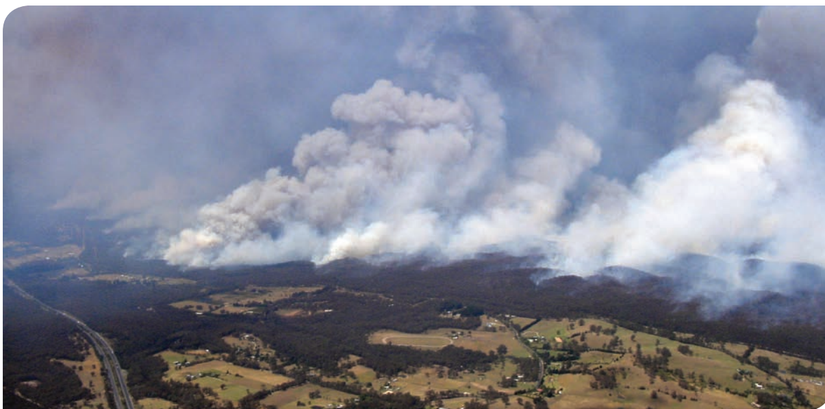
Columns of smoke from burning operations near Mittagong, NSW, during the December 2001 Black Christmas fires.

In northern Australia, few years pass without large areas being burnt. Around 90 per cent of the area of Australia burnt by fire each year is found north of the Tropic of Capricorn, with burning occurring during the dry season, generally between April and November. These fires usually have a relatively low economic impact because of the low population density and the dispersed nature of built assets. Increasingly however, we are gaining a better understanding of the effect of these fires on biodiversity, greenhouse gas emissions and carbon balances. In the grazed rangelands of northern Australia, fire remains both a threat to livelihoods and a valuable tool for managing pastures, weeds and livestock and for maintaining land condition.