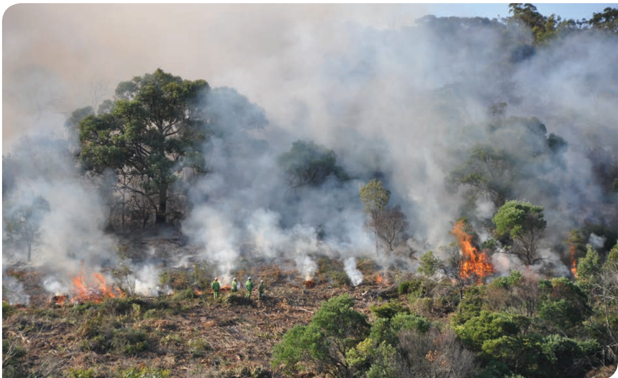
High intensity post harvest slash burn at Rosebud, Victoria, in 2010 to ensure healthy and vigorous regeneration.

Manage planned fire and unplanned fire (where appropriate), to reduce the risk of severe bushfires impacting on communities, and enhance the health, biodiversity and resilience of Australia's forests and rangelands. Underpinning this goal is an understanding that planned and managed fire can play a positive role in reducing the scale and magnitude of bushfires, and promote more healthy and productive forest and rangeland ecosystems.