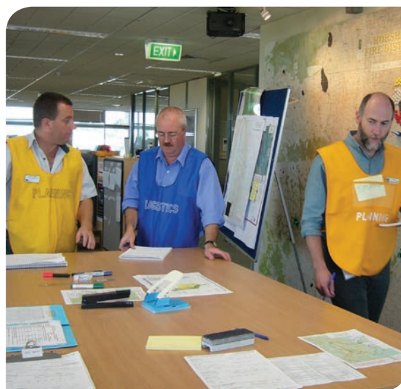
Incident Management Team (IMT) operating at Horsham, Victoria, in 2004.

There needs to be consistency of purpose during bushfire risk mitigation, and unity and clarity of command for all fire response, irrespective of organisational structures.