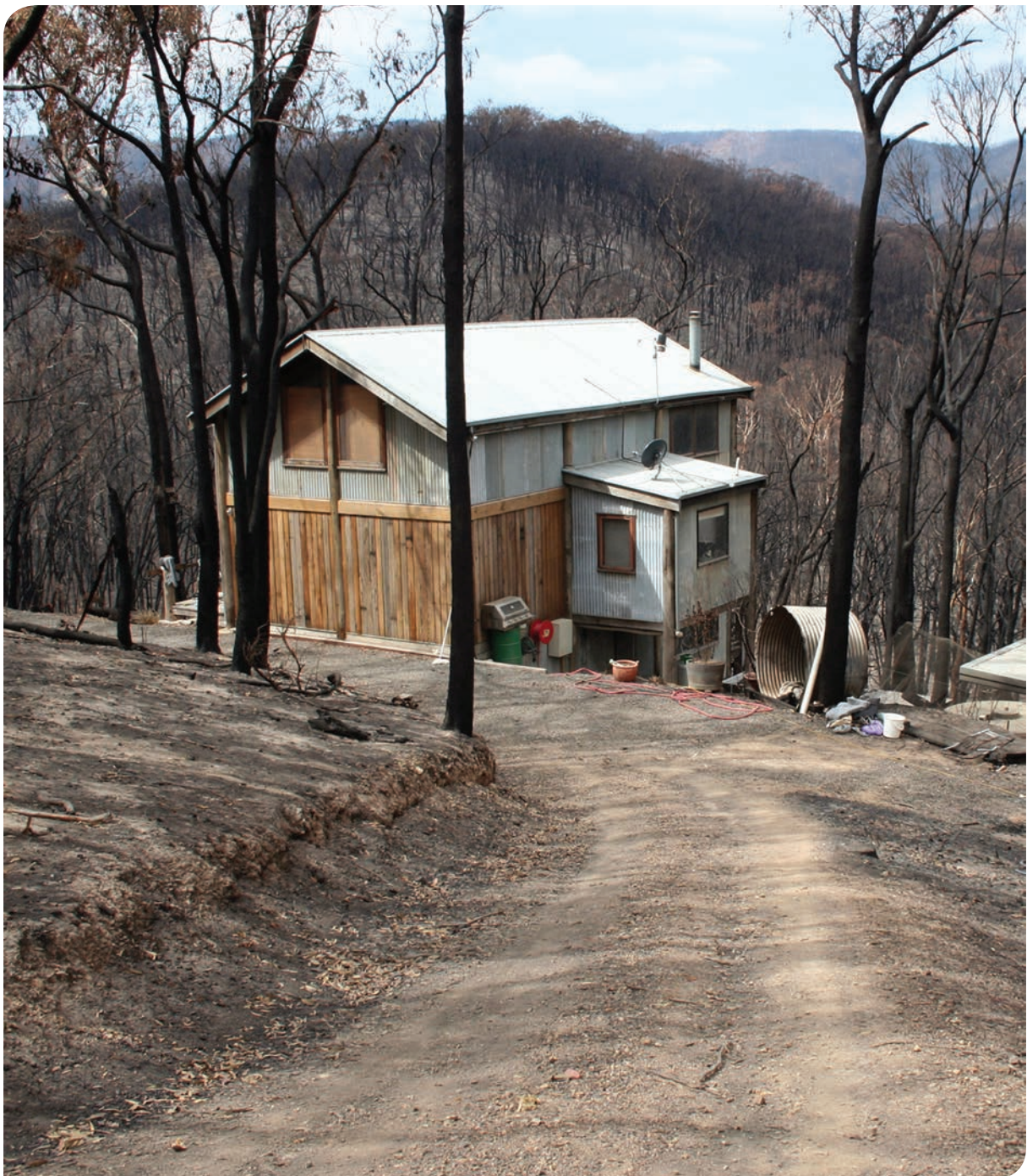
House at Strathewen, Victoria, that was successfully defended in the February 2009 Black Saturday fires.

A subset of forest plant communities in which the trees form only an open canopy (between 20 per cent and 50 per cent crown cover), the intervening area being occupied by lower vegetation, usually grass or scrub.