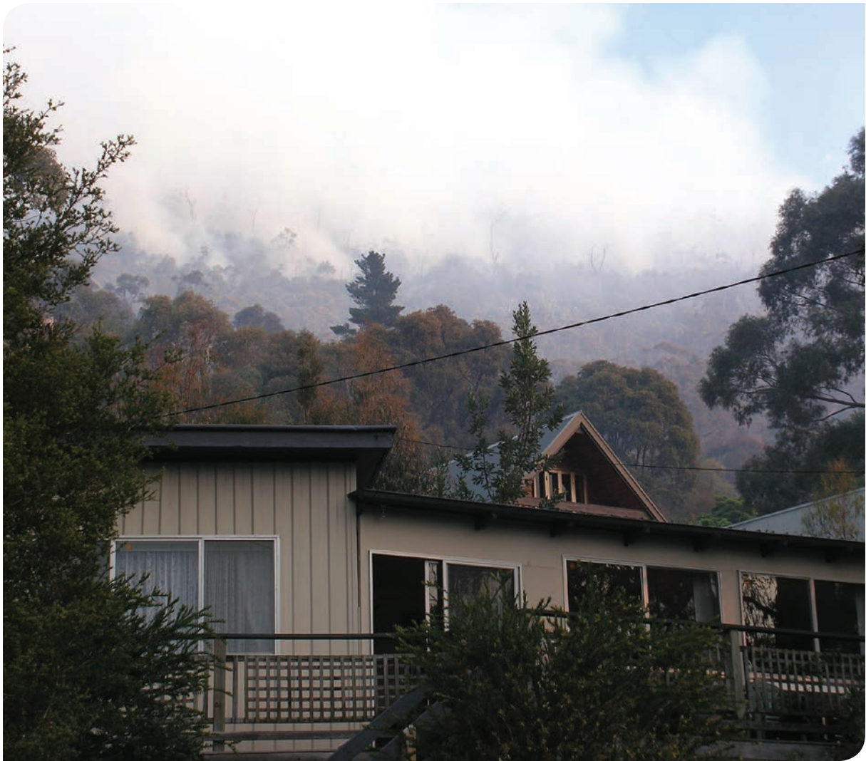
Planned burning to minimise the risk and impact from unplanned fires.

All governments have agreed to take responsibility for implementing this statement. Several of the policies contained within this statement can be implemented immediately; others depend on further work. Reports on the implementation of progress will be prepared by the Forest Fire Management Group – a committee of government officials from production and conservation forest management agencies.