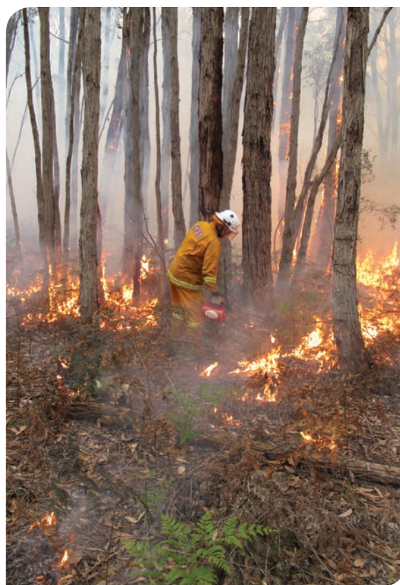
Implementing a planned fire to reduce fuel loads in native forest at Deep Creek, South Australia, in September 2011.

'...in forest and rangeland ecosystems, reducing the fuel reduces bushfire risk.'