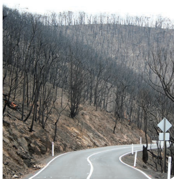
Kinglake Road, Victoria, one week after the February 2009 Black Saturday fires.

'...appropriate use of planned fire to protect communities and their assets, and to protect and conserve natural and cultural values.'