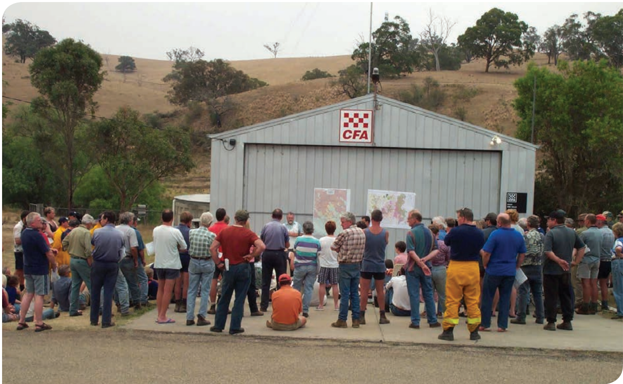
Town meeting at Swifts Creek, Victoria, in February 2003 (photo: Department of Environment and Primary Industries, Victoria).