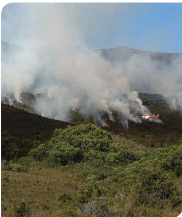
2011 fuel reduction burn at Red Tape Creek, Tas, using aerial incendiaries (photo: Paul Black, Parks & Wildlife Service, Tasmania).