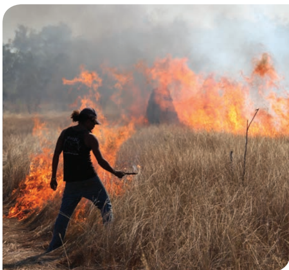
Traditional lighting of the landscape in Cape York, in July 2011.

In the meantime, land and fire managers will not let the lack of a comprehensive framework for planned fire, or short-term and local risks involved in using fire, unduly constrain the use of planned fire to manage the risk of severe fire impacts.