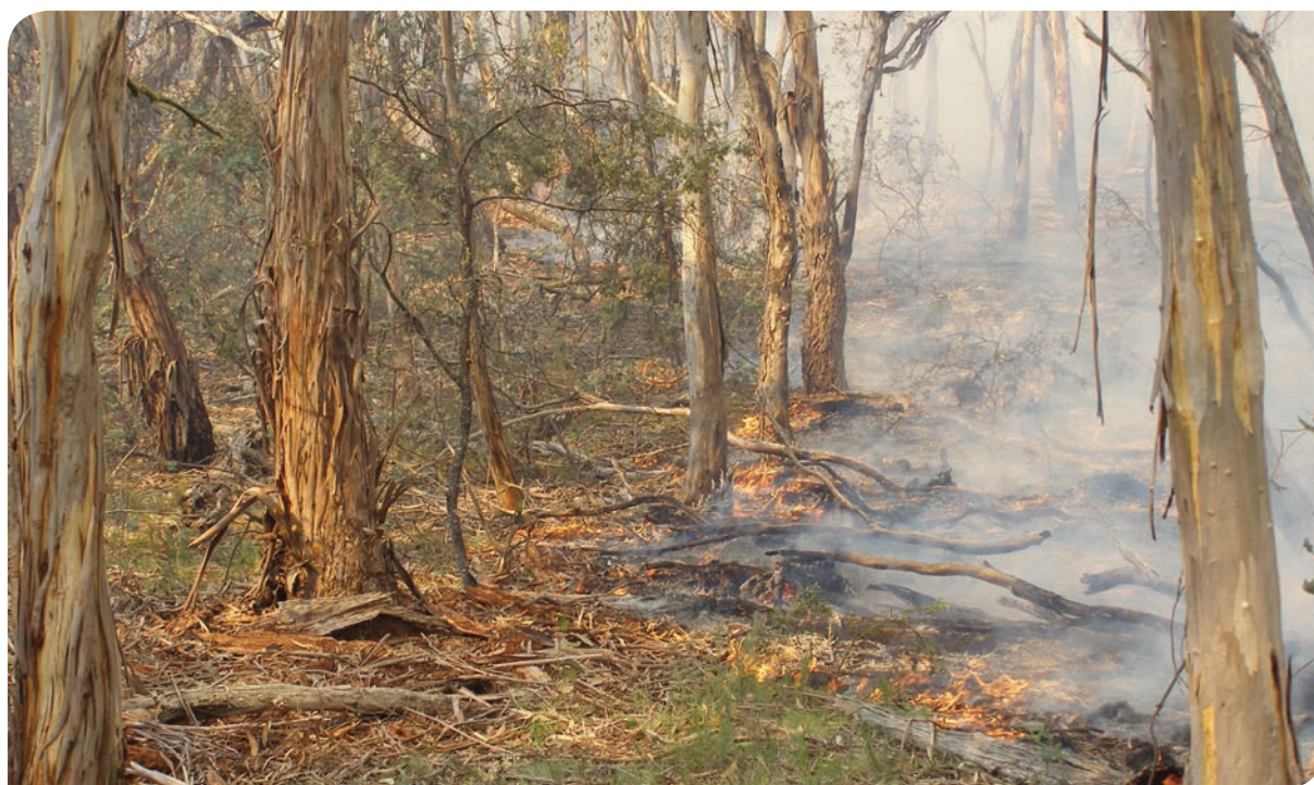
Low intensity fire in long unburnt native forest in Namadgi, ACT, 2009.