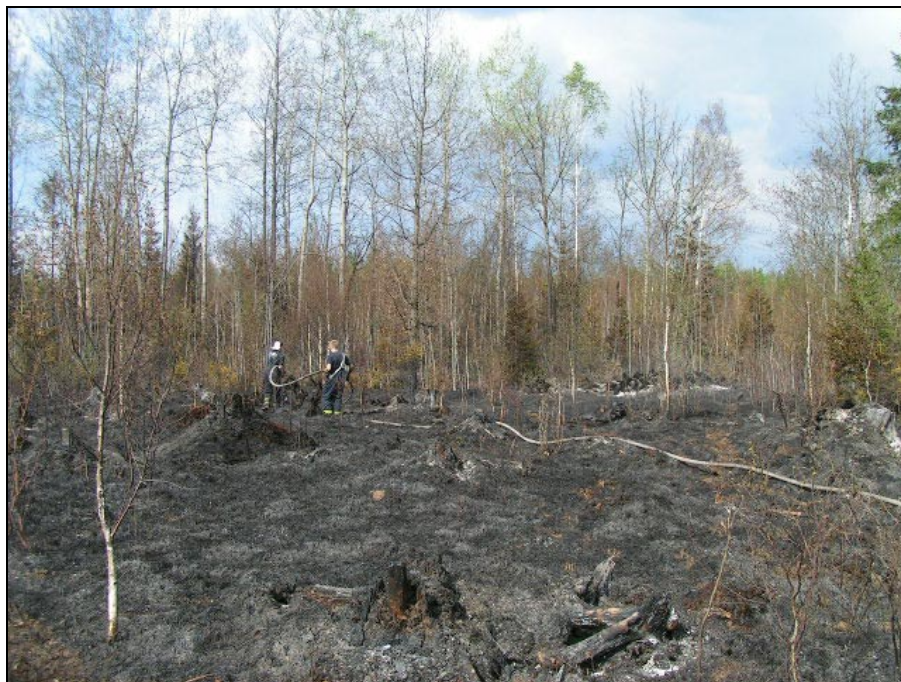
Figures 4 and 5. Sufficient supply of water for suppression of fires in organic layers (e.g. in peat and bogs) is critical for successful intervention of the Estonian fire brigades.