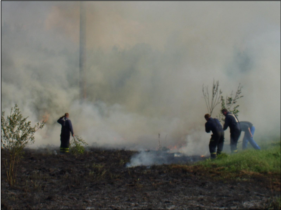
Figures 2 and 3. Use of traditional tools and methods of fire fighting in Estonia