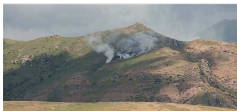
Figures 1 and 2. Typical wildfires on agricultural and pasture lands in Armenia caused by crop residual and intentional pasture burning.