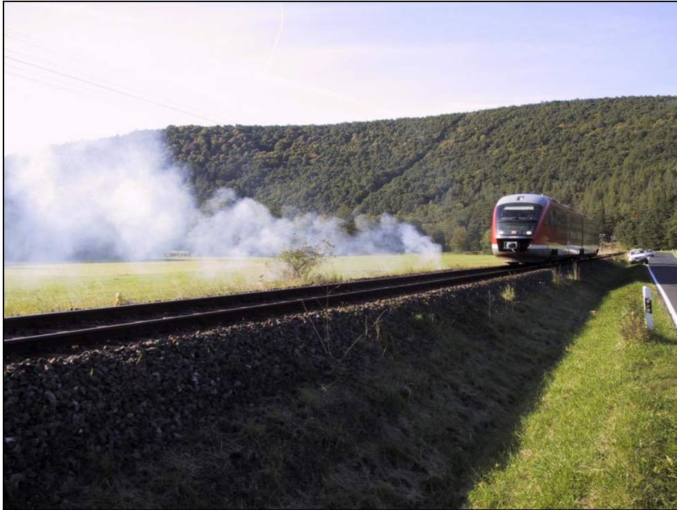
Figure 6. Passing of a passenger train during a prescribed burning operation. The photograph reveals the importance of prescribed wind conditions. Smoke management considerations in average situations require burning at the downwind (lee) side of embankments in order to drive the smoke away from the rails.

After the devastating fire season of 2003 German Railways requested the support of the Fire Ecology Research Group / Global Fire Monitoring Center (GFMC), Freiburg, Germany, to conduct initial trials in order to prove environmental-friendly and safe burning procedures. First experiments were conducted in Bavaria in August and September 2004.