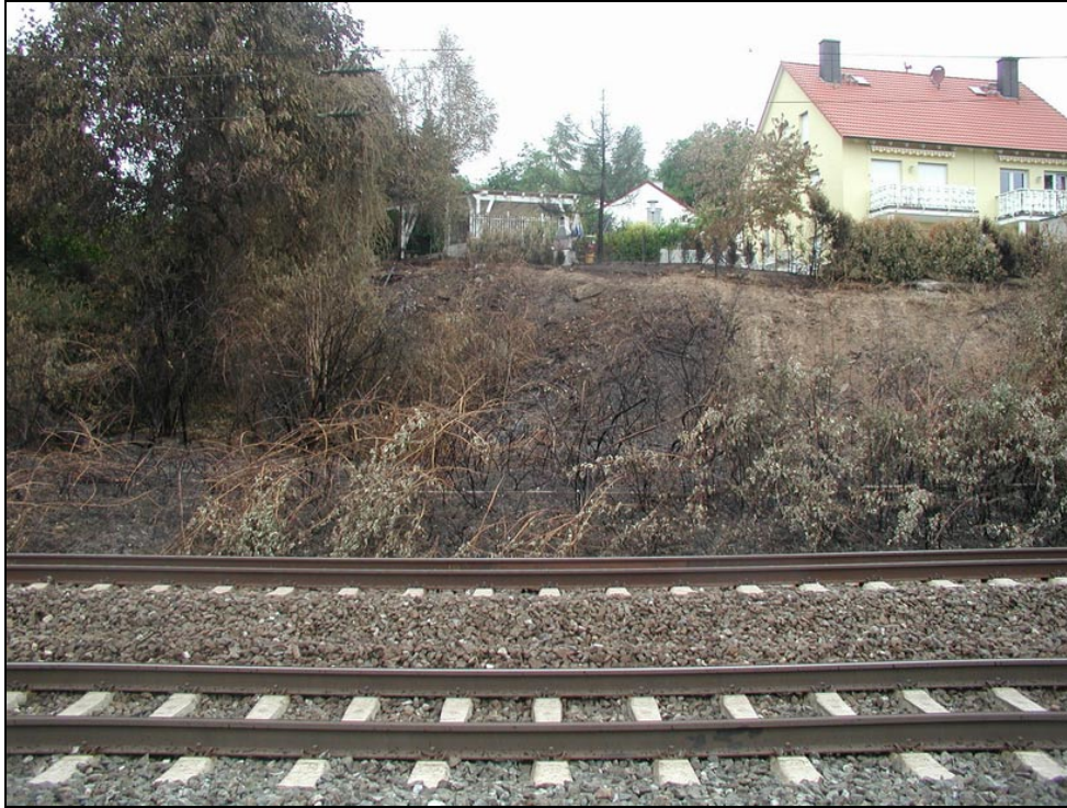
Figure 2. This family home was damaged by wildfire spreading from the slope in summer 2003.