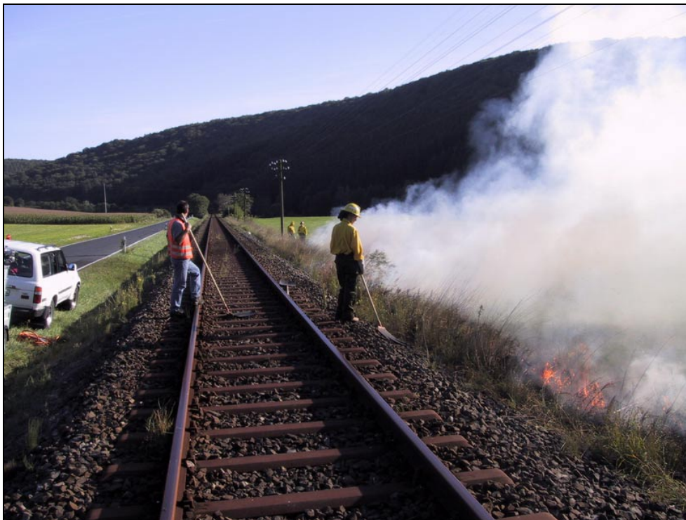
Figure 5. Timing and coordination of prescribed burning operations with railway traffic control is required to ensure safe traffic. This photograph shows a prescribed burning trial along a single-rail track in Bavaria.

Other aspects of prescribed burning on railroad embankments include the necessity of halting succession from grass-stage vegetation towards bush and tree encroachment. This is not only a consideration affecting traffic safety. Open slopes along railroads are providing valuable home for valuable floristic and faunistic biodiversity, including endangered species. For instance, the habitat requirements for lizards (e.g., Lacerta viridis , Lacertidae) include open grass stages and a warm soil surface during daytime. Some plant species are endangered due to bush and tree succession, e.g., heather ( Calluna vulgaris , Erica tetralix ) – a development which can be controlled by the application of prescribed fire.