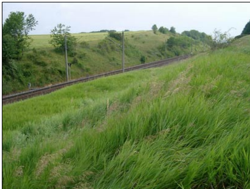
Figure 4. Typical grass fuel bed on embankments along a railroad track in Unterfranken, Bavaria, Germany. The main species grass species in this region include Glyceria declinata , Brachypodium pinnatum and Arrhenatherum elatius (Poaceae), which become highly flammable during dry spells.

The embankments of those railroad tracks that are typically affected by wildfires is dominated by grass cover. During dry summers, at the peak of the fire season, the desiccated grass layer constitutes a flash fuel bed which is easily ignited by sparks – even if these have a short lifetime of glowing.