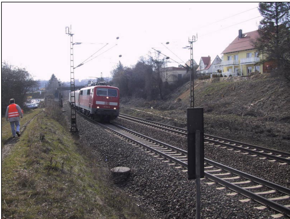
Figure 1. Railroad track embankments also constitute a risk of fires spreading into residential areas such as this situation in Unterfranken, Bavaria.

During the extremely dry year 2003 more than 800 wildfires occurred along the railway network throughout the Federal Republic of Germany, resulting in considerable operational disturbances and delays of trains. In order to ensure safety of railway traffic and fire fighters the tracks have to be closed immediately after reporting of a fire. The response to the fire alert by the fire services is quite rapid. However, the duration of track closure is determined jointly by the fire services and German Railways (Deutsche Bahn AG). Opening of the railway traffic is permitted after fires are extinguished. Thus, the duration of halting the traffic does not depend on the coordinated organization of the response. Most critical is the composition of vegetation and fuel loads in the immediate vicinity of tracks on which trains have to reduce speed by breaking. Sparks that are generated by the breaks provide the ignition source of flash fuels within a belt of a couple of meters width on both sides of the railroad track. Thus, German Railways is investigating options for fuel management, especially in extreme droughts such as in the summer of 2003. Prescribed burning for fuel reduction is one of the fuel management options.