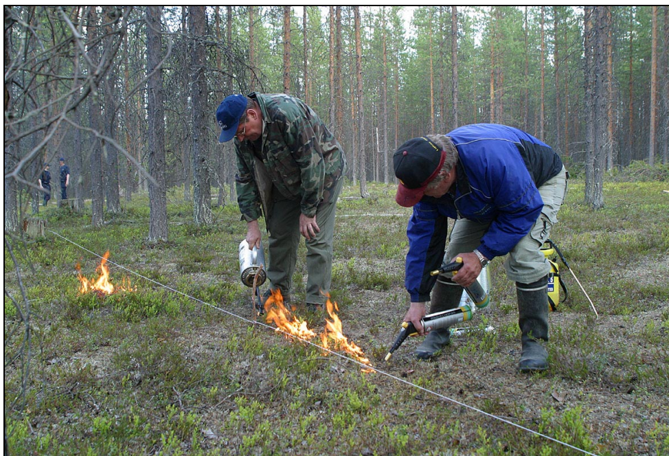
Figure 3. Ignition of the experimental fire in a Pinus sylvestris stand.

During the fire event, fire spread, flame length and weather conditions have been measured (Figure 4). After fire, various fire effects, such as tree mortality, changes in the soil and vegetation etc. have been studied. With these experimental burnings research tasks are generally various and research aims finally to create fuel type classification of Finnish forests, description of fire behavior in different vegetation types, develop Finnish fire risk index & forest fire risk assessment. In connection to this, e.g. FMC measurements and flammability tests with different materials have been carried out. The collected information will be finally also used in developing prescribed burning and restoration methods and techniques.