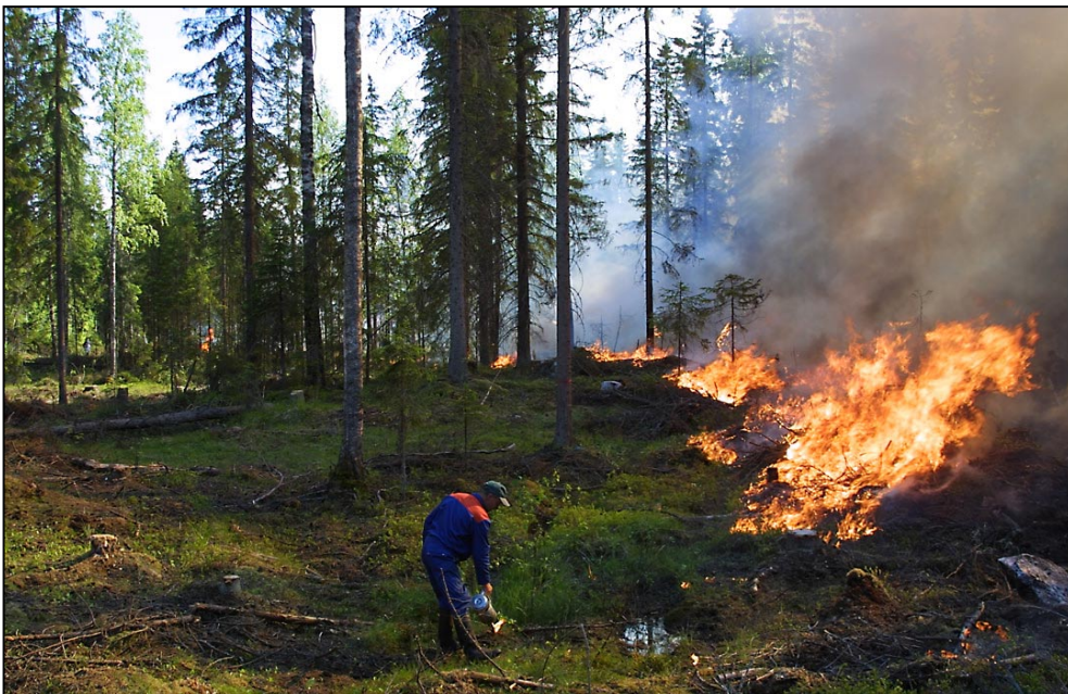
Figure 6. Restoration burn in a spruce-dominated mature managed forest stand