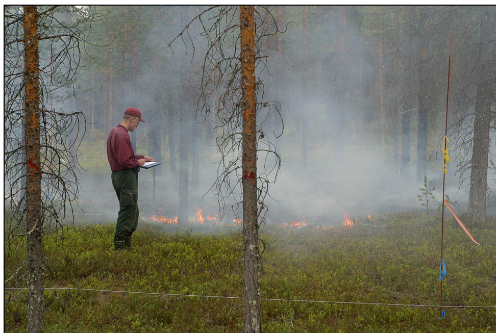
Figure 4. Recording of fire behaviour parameters during the fire experiment

During the fire event, fire spread, flame length and weather conditions have been measured (Figure 4). After fire, various fire effects, such as tree mortality, changes in the soil and vegetation etc. have been studied. With these experimental burnings research tasks are generally various and research aims finally to create fuel type classification of Finnish forests, description of fire behavior in different vegetation types, develop Finnish fire risk index & forest fire risk assessment. In connection to this, e.g. FMC measurements and flammability tests with different materials have been carried out. The collected information will be finally also used in developing prescribed burning and restoration methods and techniques.