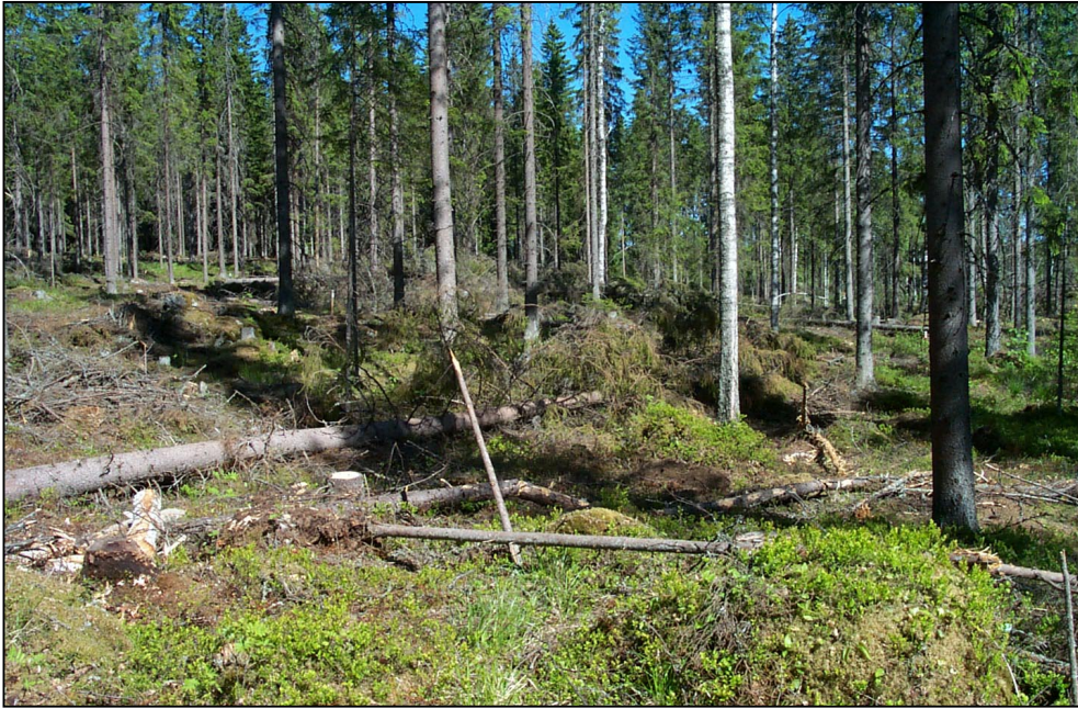
Figure 5. Logging and prescribed burning experiment in Norway a spruce-dominated mature managed forest stand