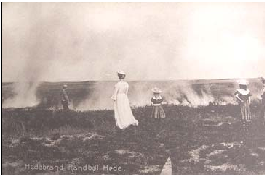
Figure 2. Prescribed burning for regeneration of Calluna heather, Randbøl Hede (Denmark), around 1900.