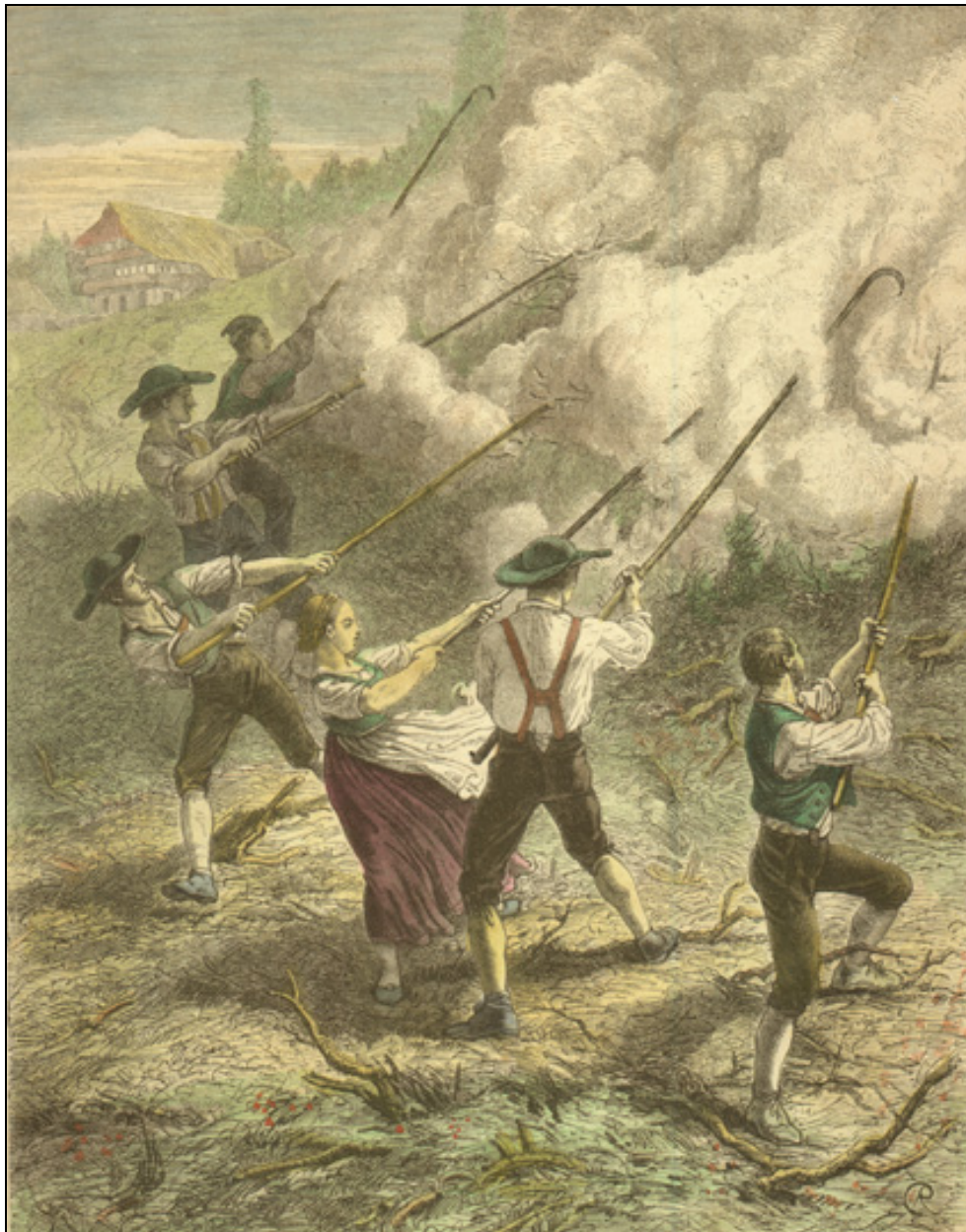
Figure 4. Slash-and-burn agriculture (“Reutebrennen”) in the Black Forest, Germany, in the second half of the 19 th Century.

It is also being increasingly recognised that both the cultural and natural heritage of many areas needs the intervention of prescribed fire to mimic disturbance events and maintain open and diverse habitats and landscapes. There are now prescribed burning projects in many of the countries of Western and Baltic Europe supporting a wide variety of land management objectives using a variety of techniques. Information on the work being carried out in the United Kingdom, Netherlands, Germany, Sweden and Finland are given later in this paper. The European Fire in Nature Conservation Network (EFNCN) website is an important focus for discussion (EFNCN 2004).