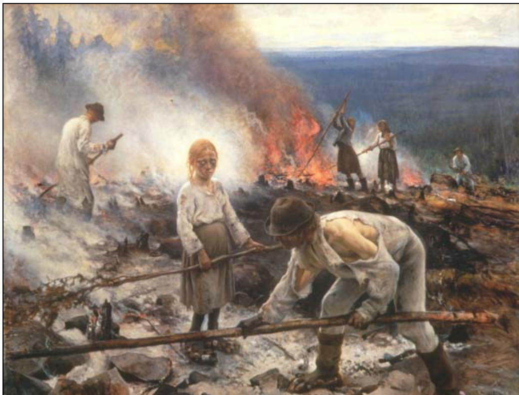
Figure 3. Slash-and-burn agriculture in Finland in the second half of the 19 th Century. Painting by Eero Järnefelt (1873): "Raatajat rahanalaiset". Exhibition of painting: Ateneum, Helsinki, Finland.

Traditional burning practises that are used to support hunting (grouse moor management), most evident in the United Kingdom, are also gradually changing. Empirically based fire modelling research is also being conducted in a number of countries, including the United Kingdom and Germany. Traditionally burning was often a shared activity between neighbours or it drew on other resources within land management units. There are fewer people with appropriate fire knowledge in rural areas to share the task now. The people left are generally older and less prepared to take the risks of wildfires occurring due to escapes. Insurance is becoming more expensive to obtain and so the use of fire is being constrained in many areas due to the significant resource requirements and financial costs. There is a need to increase the productivity of practitioners by implementing training initiatives and developing a professional prescribed burning skill base. Technical developments and research are also expanding the window of opportunity for burning and helping fire suppression efforts (Murgatroid 2002).