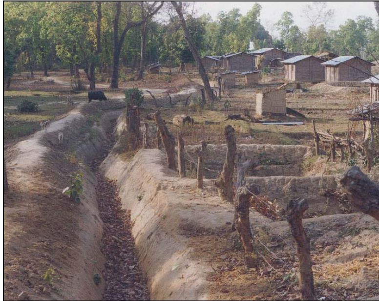
Figure 5: Community managed trench lines in Radhakrishna CFUG, Kailali

Local communities play a significant role in preventing and suppressing harmful fires because they have clear understanding of local conditions and circumstances important for successful fire management. They also possess valuable knowledge of place, fire history and fuel loading. Local site-specific knowledge of and experience with terrain, past fire behaviour and locations for emergency fire lines, could save lives, time and money during emergencies. As public awareness grows, it is hoped that forest users actively participate in forest fire management activities and maintain forest biodiversity. In general, when communities have sense of ownership, they are more inclined to take interest and action in the management of fire. The abandonment of rotational shifting cultivation practice or traditional rights (free grazing) over resource access makes fire management more difficult.