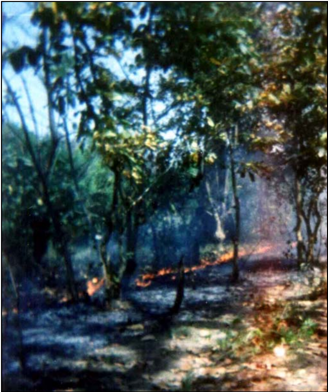
Figure 3: Forest fire in Radhakrishna CFUG, Kailali