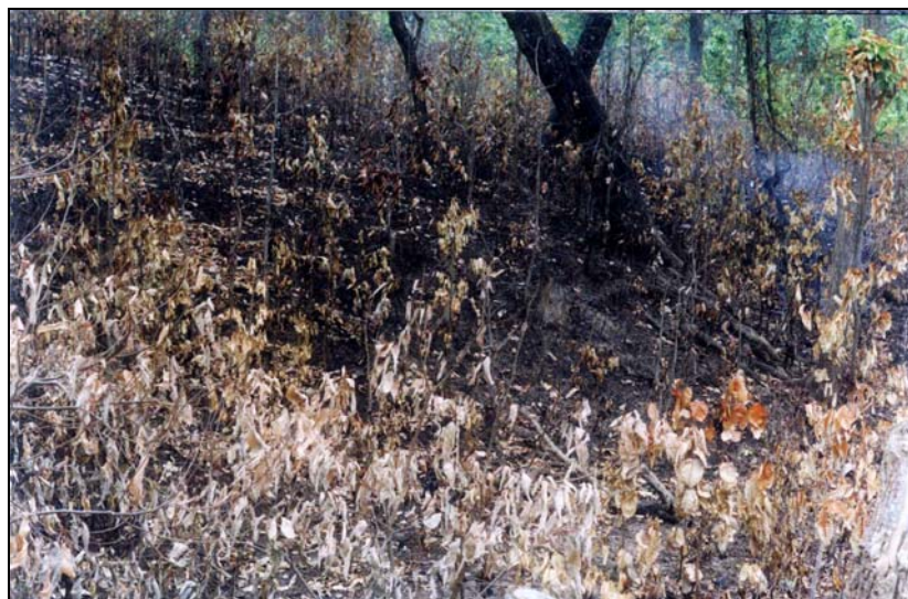
Figure 4: Forest fire in Hariyali CFUG, Kailali

People with a complaint against the forest officials sometimes start fire maliciously. Such a situation is created, as people are dissatisfied with the way of forest department staff's use of power to control resources. Another causes of forest fire are the conflicts that arise with perverse policy (e.g. community forests' revenue sharing mechanism, collaborative forest management, delaying handover the forest to community, lack of tenure security, ownership and incentives) and external forces (e.g. demographic changes, high migration) (Figure 4).