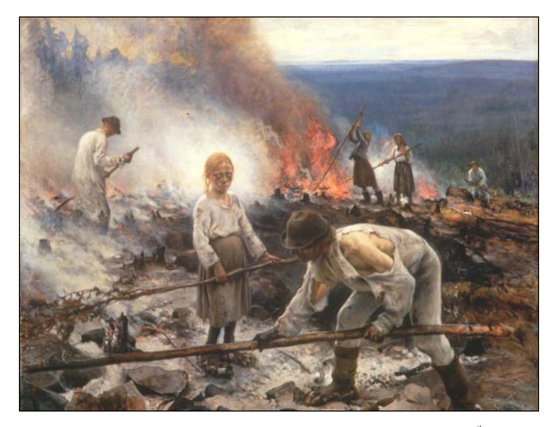
Figure 3. Slash-and-burn agriculture in Finland in the second half of the 19<sup>th</sup> Century. Painting by Eero Järnefelt (1873): "Raatajat rahanalaiset". Exhibition of painting: Ateneum, Helsinki, Finland.

Traditional burning practises that are used to support hunting (grouse moor management), most evident in the United Kingdom, are also gradually changing. Empirically based fire modelling research is also being conducted in a number of countries, including the United Kingdom and Germany. Traditionally burning was often a shared activity between neighbours or it drew on other resources within land management units. There are fewer people with appropriate fire knowledge in rural areas to share the task now. The people left are generally older and less prepared to take the risks of wildfires occurring due to escapes. Insurance is becoming more expensive to obtain and so the use of fire is being constrained in many areas due to the significant resource requirements and financial costs. There is a need to increase the productivity of practitioners by implementing training initiatives and developing a professional prescribed burning skill base. Technical developments and research are also expanding the window of opportunity for burning and helping fire suppression efforts (Murgatroid 2002).