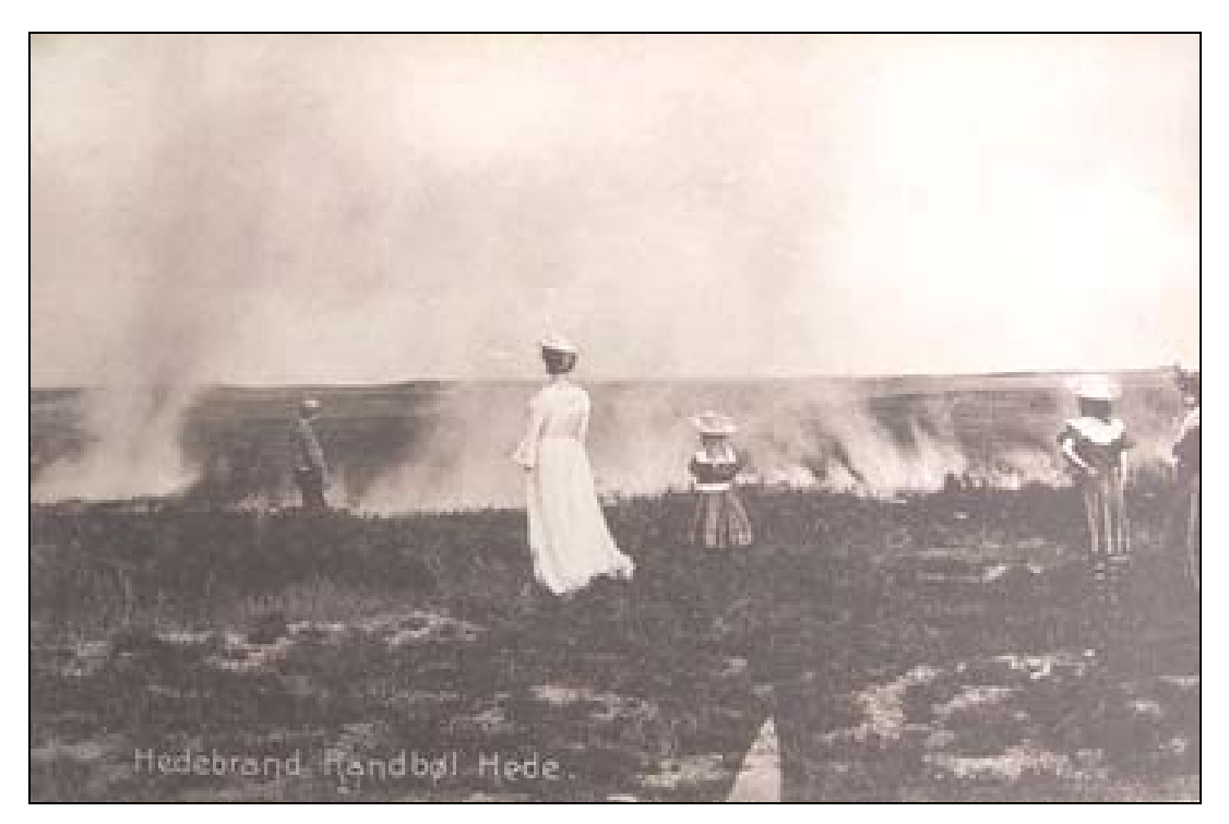
Figure 2. Prescribed burning for regeneration of Calluna heather, Randbøl Hede (Denmark), around 1900.