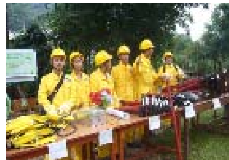
Trained volunteer firefighter leader group