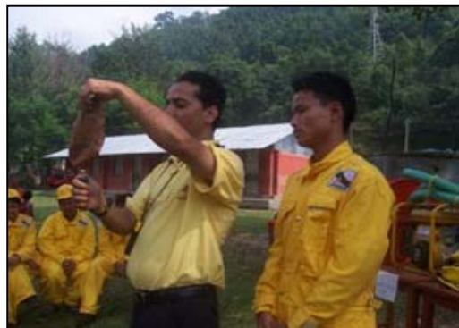
Demonstration of 'Leaf burning technique' to determine the fire risk index.