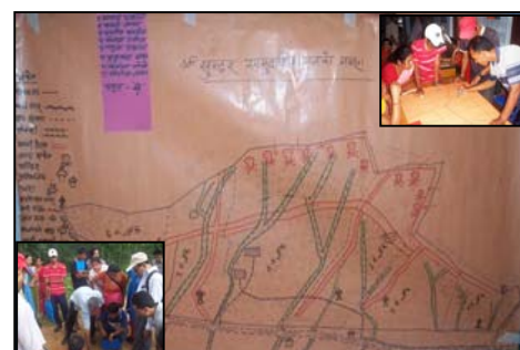
Participatory resource map (PRM) prepared by the local people