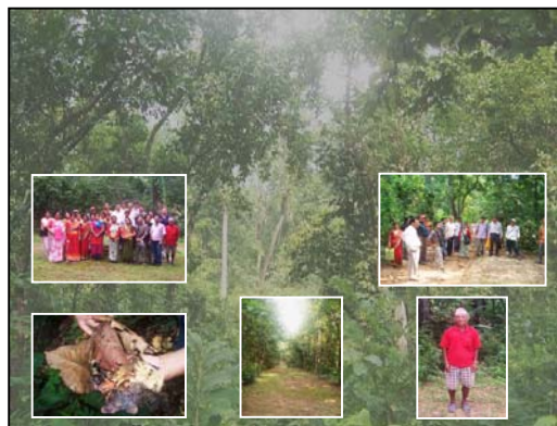
Field visit to show villagers the effects of fire breaks