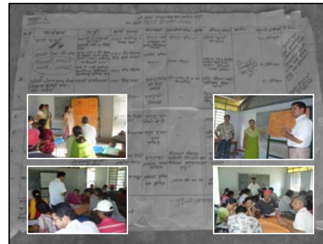
Action plan was being prepared through interactive process