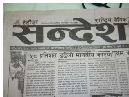
News cutting highlighted the need for training for fire disaster mitigation

http://www.fire.uni-freiburg.de/GlobalNetworks/South_Asia/Media_1.html