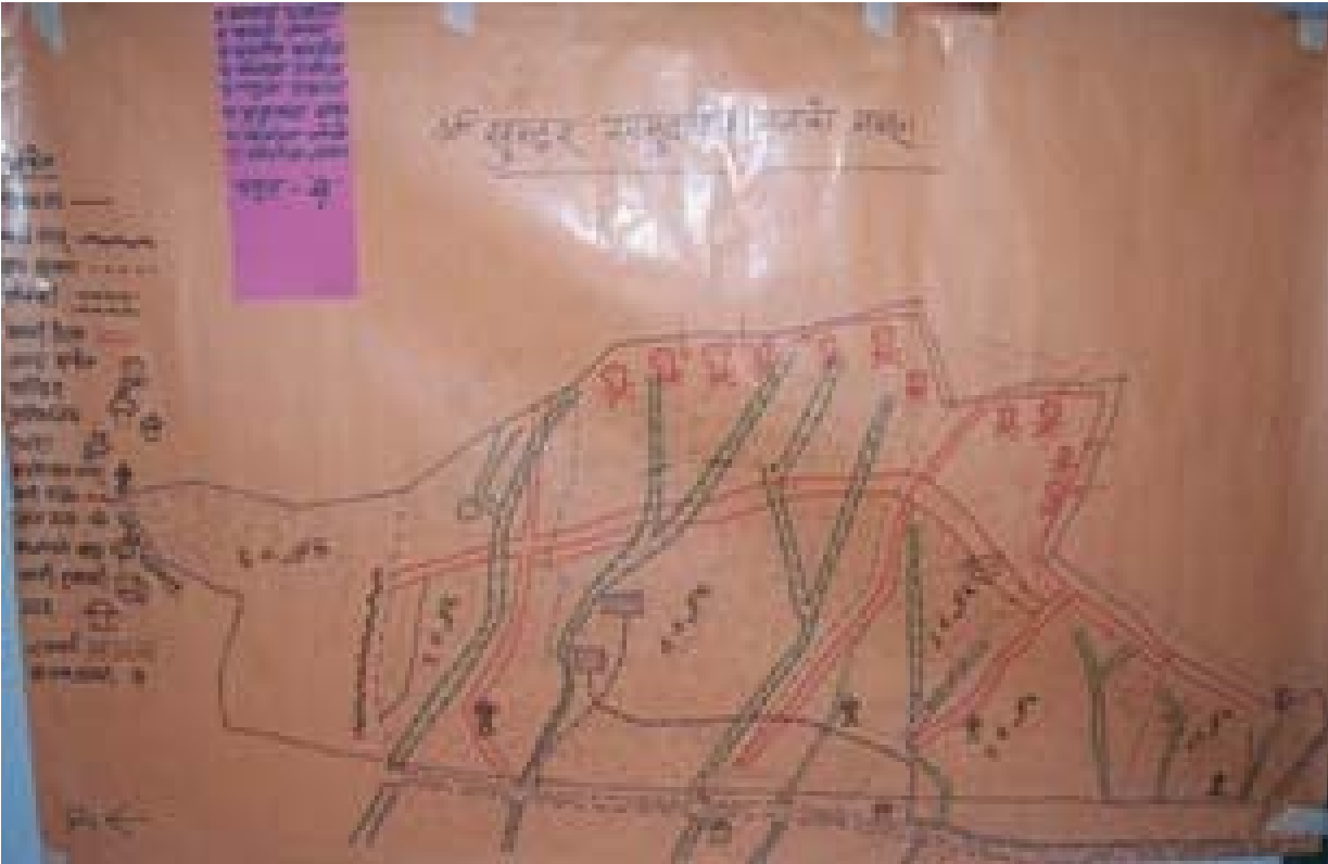
Annex VI: The participatory resource map (PRM) of Sundar Community Forest, Chaukitole, Hetauda, Nepal