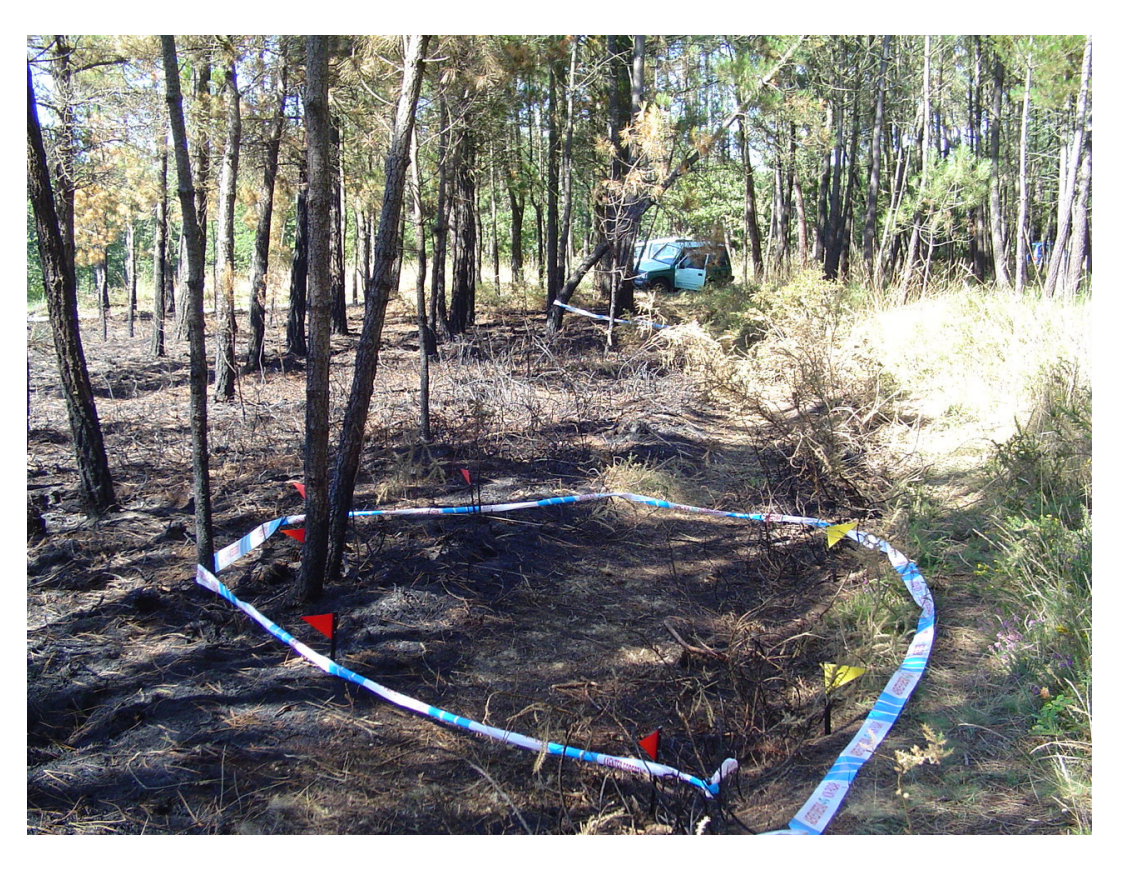
(Galicia, Spain)

Fire Investigation: "The process of determining the origin, cause, and development of a fire." (NFPA 921)