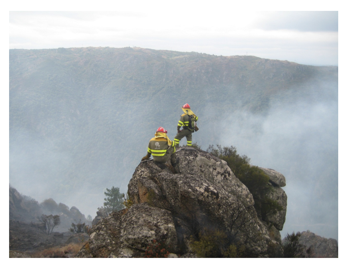
A lookout monitoring a wildfire to ensure the safety of wildfire suppression personnel