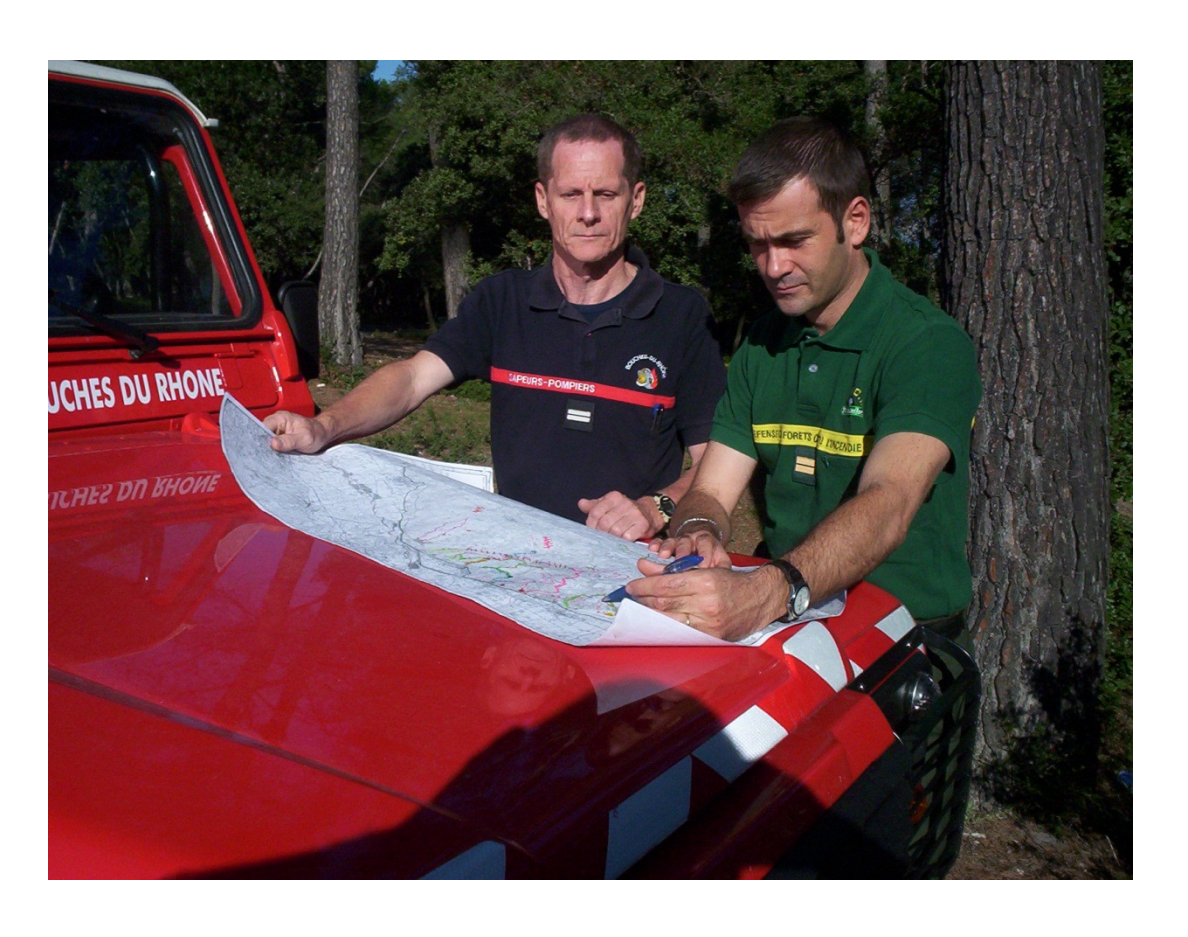
© Office National des Forêts (France)

Cartography: "The study of maps and the practice of map making."