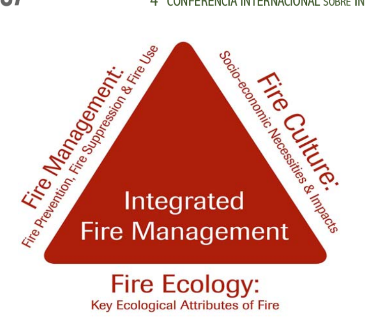
Figure 3. Integrated fire management triangle illustrates that fire management decisions need to be coupled with knowledge about fire ecology and the fire culture. From Myers (2006).

Sevilla, ESPAÑA. 13 -17 mayo 2007 4ª CONFERENCIA INTERNACIONAL SOBRE INCENDIOS FORESTALES