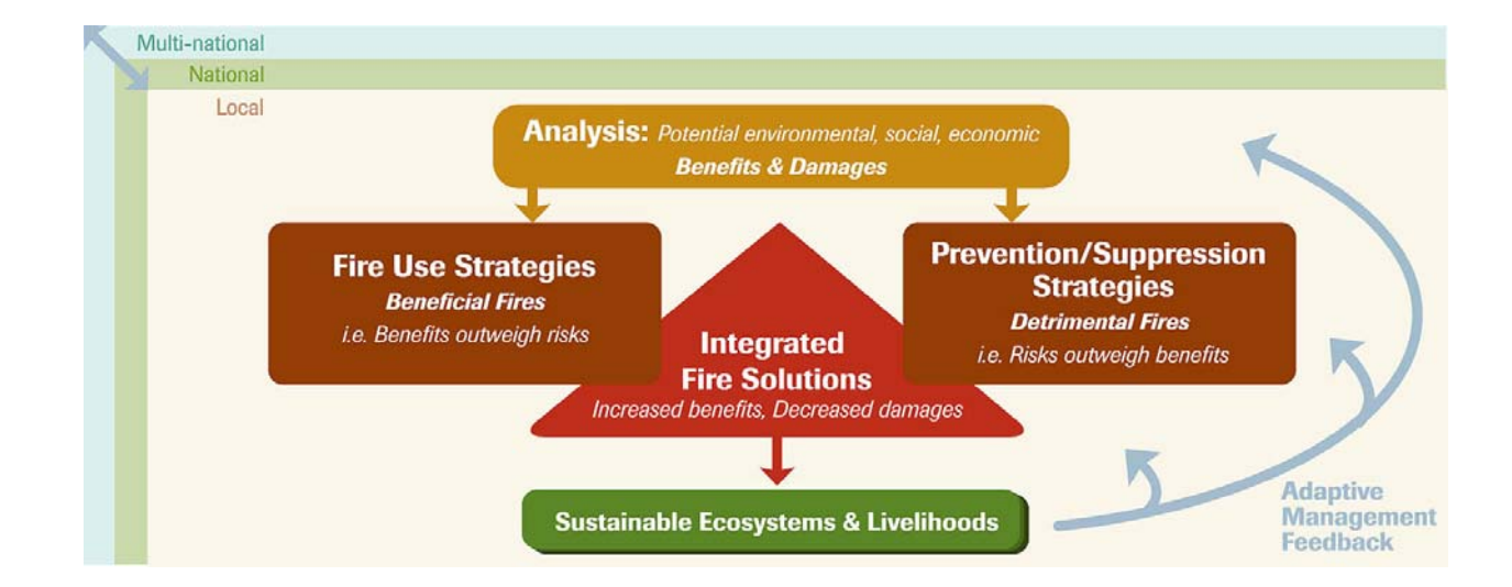
Figure 4. The goal of integrated fire management is sustainable ecosystems and livelihoods. Fire management decisions have to incorporate both the fire ecology and fire culture of the area under consideration and determine the relative importance of fire use and prevention suppression strategies. From Myers (2006).

Figure 3. Integrated fire management triangle illustrates that fire management decisions need to be coupled with knowledge about fire ecology and the fire culture. From Myers (2006).